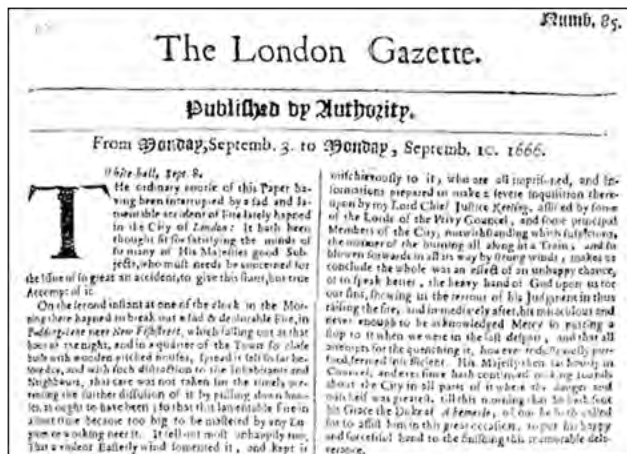
Copy of the London Gazette discussing the Great Fire of London in 1666.

The PCC wills are now available on Ancestry.co.uk . This covers almost 500 years of probate matters, from 1384 until the abolishment of the ecclesiastical courts' jurisdiction over probate. No matter where your ancestor lived in England, you must check the PCC as well as the local jurisdiction to find potential probate records.