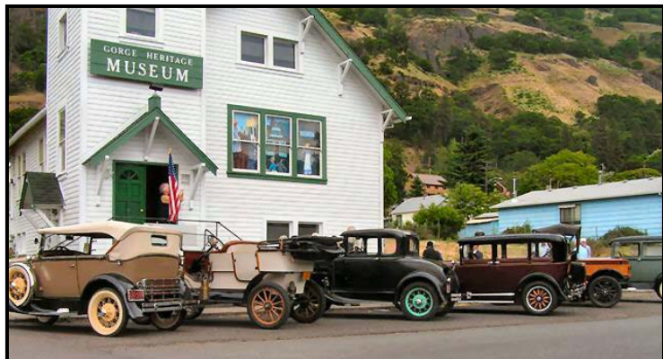
Gorge Heritage Museum 202 East Humboldt, Bingen, WA.

Published Quarterly by Gorge Heritage Museum Issue 12 Sep/Oct/Nov/Dec 2010