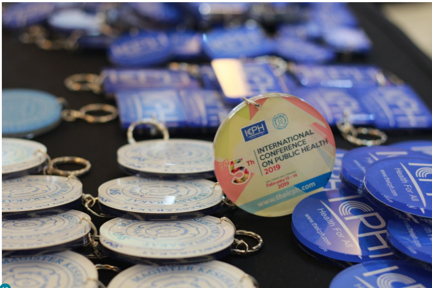
12 ( http://theicph.com/wp-content/uploads/2019/08/ICPH-KEY-CHAIN.jpeg )