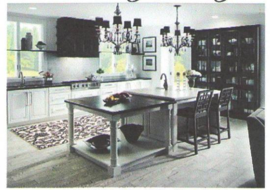
Featuring: KraftMaid & Merillat Cabinetry

Sales - Design - Installation Residential/Commercial - Licensed/Insured Free Estimates/Affordable Prices