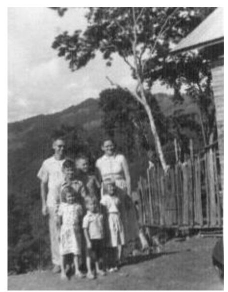
Our family in Tzanfuville -1950s

Now that the books shown above are online I'm trying to finalize chapter 8 of my memoirs. Hopefully it can be posted soon. It may interest more of you than previous chapters since it tells the stories of our life in the Mien village from 1954 to 1961.