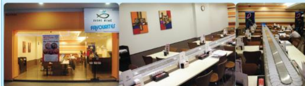
Sushi King Favourites SouthGate (Opened : 25 August 2011) Unit D-1-4, Level 1, Block D, Pusat Komersial SouthGate, No.2, Jalan Dua, Off Jalan Chan Sow Lin, 55200 KL.

更好的消息是, 我们就在您的咫尺, 随时都可品尝到。非常希望在Sushi King Favourites能见到您!