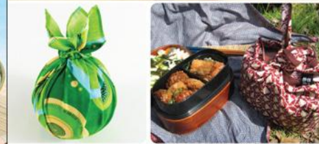
Otsukai Tsutsumi (Basic Carry Wrap)