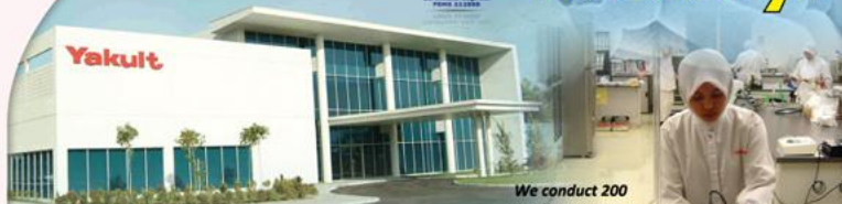
Yakult factory in Seremban, Negeri Sembilan

We conduct 200 quality assurance tests daily