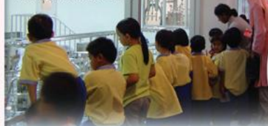
School children observing the actual production process

We conduct 200 quality assurance tests daily