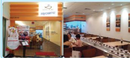
Sushi King Favourites Tesco Manjung (Opened : 27 August 2011) Lot G1, Ground Floor, Tesco Manjung, No. 103, Jalan Lumut, 32000 Setiawan, Perak.