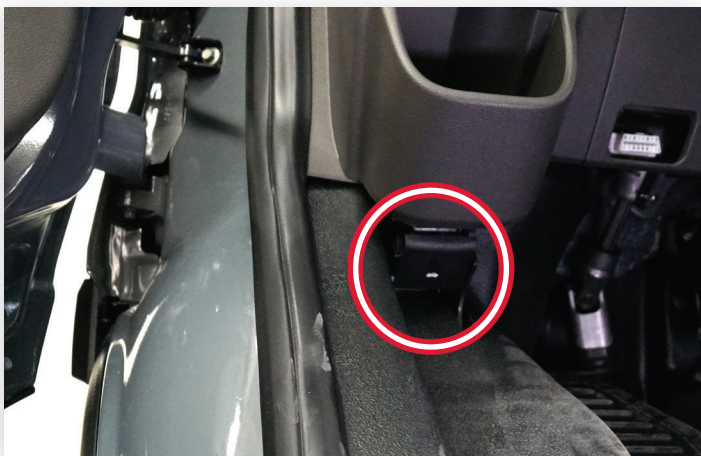
Hood Release is in Driver Side kick panel