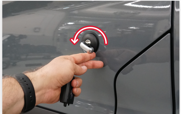
Insert Key Blade in Lock Cylinder Rotate Counter Clockwise, pull handle to open