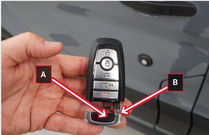
Press button on front of Key Blade (A) to remove mechanical key blade (B)