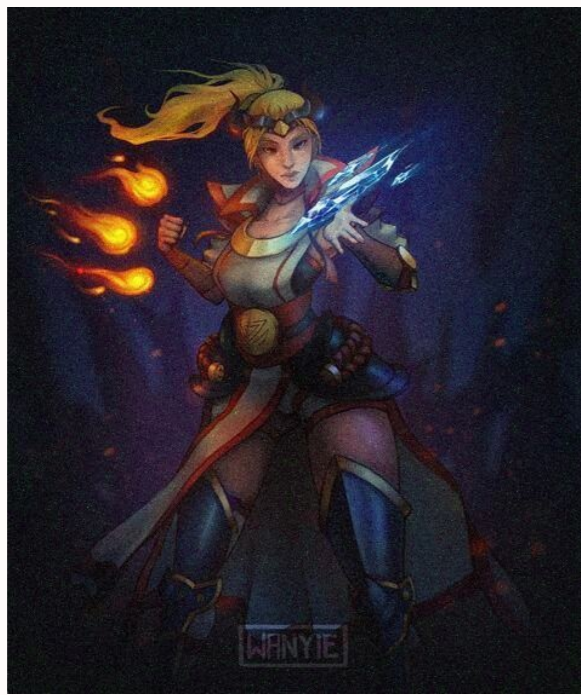
Wow dev evoker guide. What is evoker. vixiriza Dev evoker m+ guide.