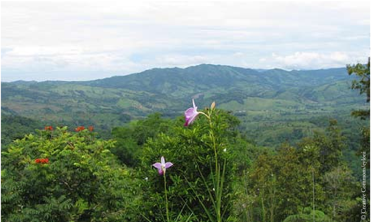
The lush green hills around Dominical

Dominical is attracting property buyers, too. Ocean view properties in the mountains behind the beach are highly sought after.