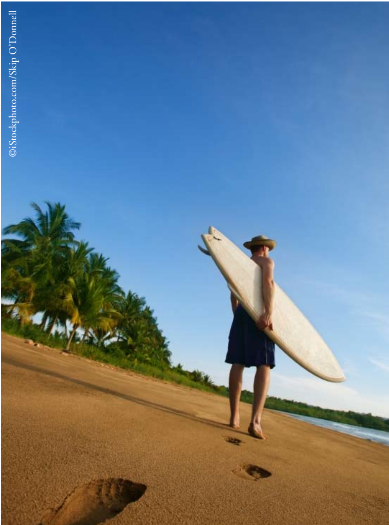
A surfer prepares to take to the water

Golfito is famous for sport fishing, with small marinas, companies offering fishing trips, and specialty lodges. The beaches south of the town are good for surfing (Pavones in particular rates as a top surf spot).