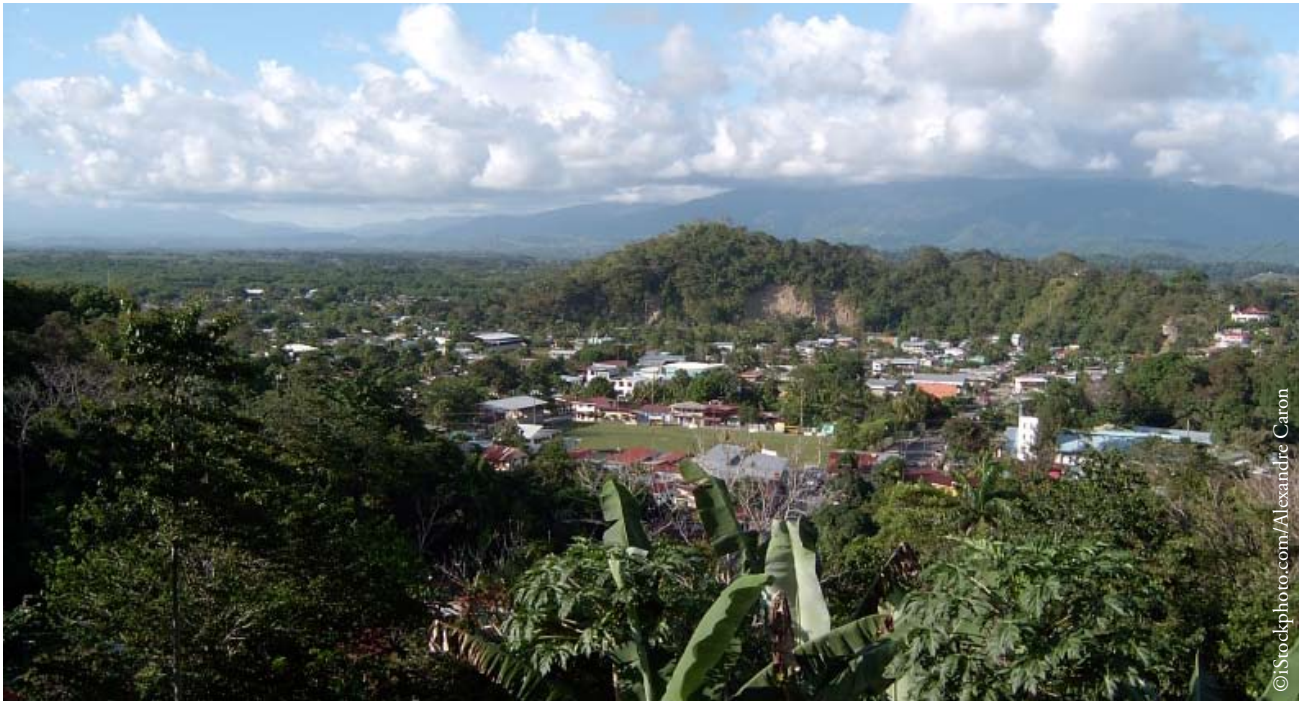
A view of the town of Quepos