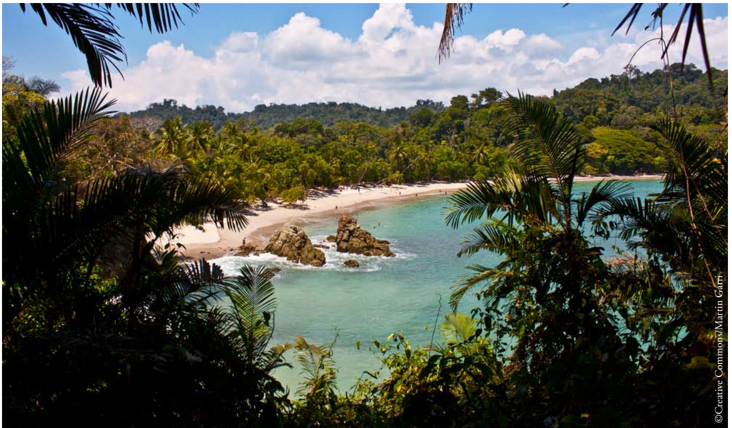
One of Manuel Antonio National Park's stunning white-sand beaches

The views from the hills overlooking Manuel Antonio are mesmerizing. The deep rich blue of the Pacific contrasts with the lush green forest, with rocky islands offshore.