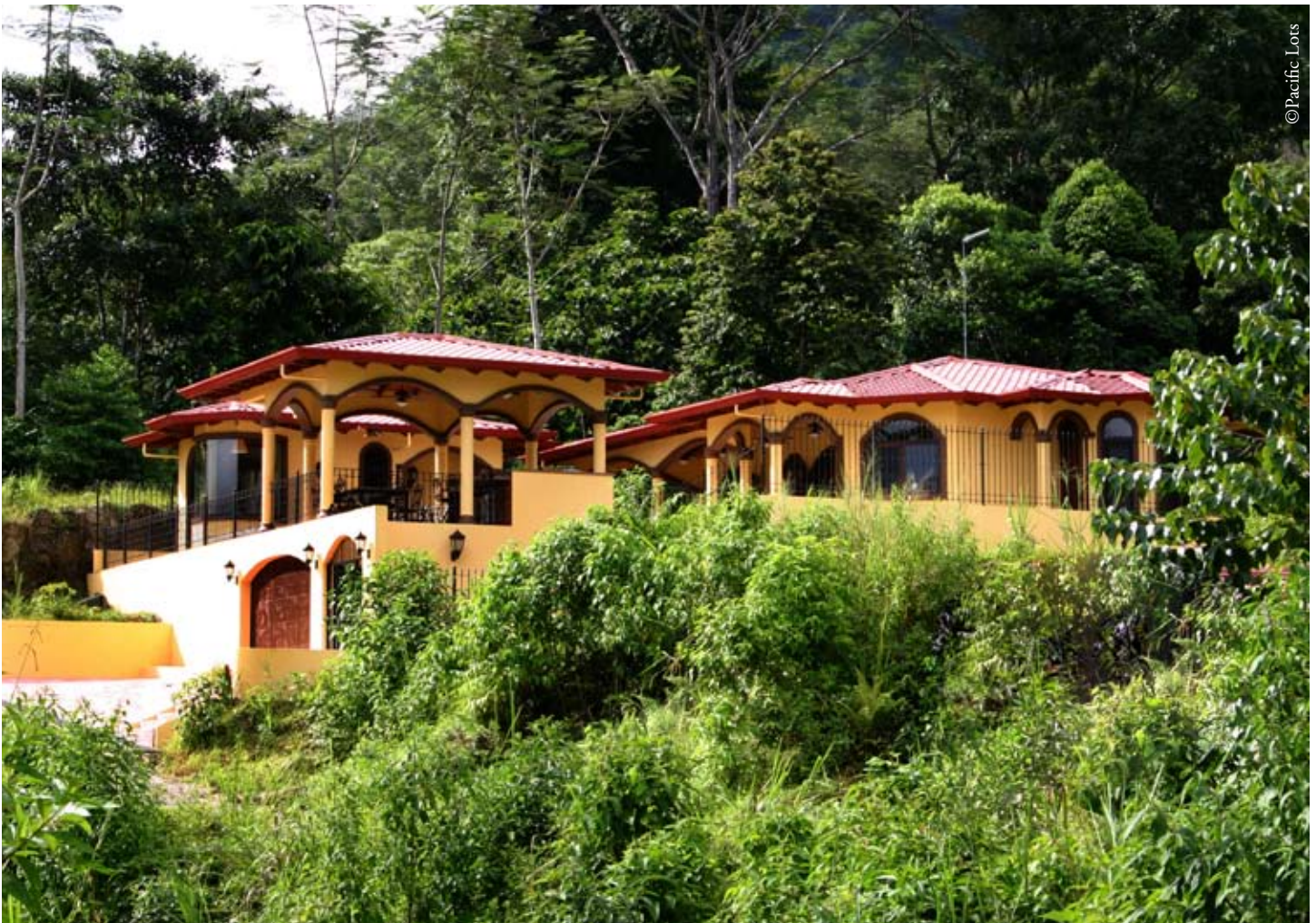
Some of the completed homes at the majestic Pacific Lots

There is no build requirement. You have full flexibility. When you decide to build, a skilled team of professionals is on hand to help you out. Today, construction of this quality and standard will cost you in the region of $100 per square foot. You can build on your own or use the custom construction and design services offered by the team at Pacific Lots. Their team of architects, engineers, concrete masons, master woodcrafters, painters, and interior designers can help you build the house of your dreams.