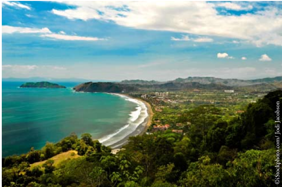
An aerial view of Jacó with the lush rainforest in the foreground

Prices for beachfront condos here were once affordable, but have increased in both scope and price. One developer had grand plans for larger units (2,300 square feet and up)—starting at $900,000. This is not a location that merits those prices. The infrastructure and amenities just don't justify it. There are much nicer beach towns further south, with more affordable properties, in much nicer surroundings.