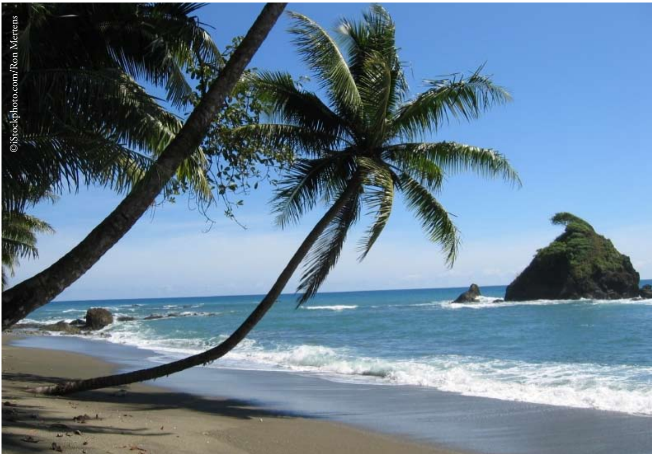
An idyllic stretch of beach in Corcovado National Park.

Hiking here is popular, and challenging. There are four ranger stations, and guided tours are available. Having a guide is advisable—it's off the beaten track, easy to become disoriented, and not all of the wild animals are cute and furry (there's a good variety of snakes, along with crocodiles and bull sharks). There's no better way of getting back to nature.