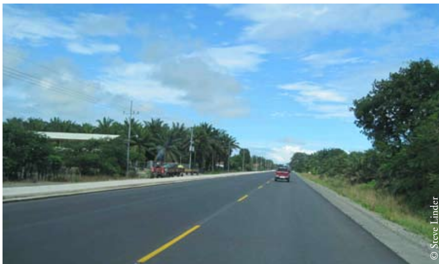
The crater-free, smooth new Costanera Highway

You can now drive from San Jose to the Southern Zone in around three hours. That's half the time it took before the road upgrades. Word will soon get out that this area is now quickly and comfortably accessible...opening it up to a whole new market of tourists and expats looking for a new and exciting location for their second home or to spend their retirement.