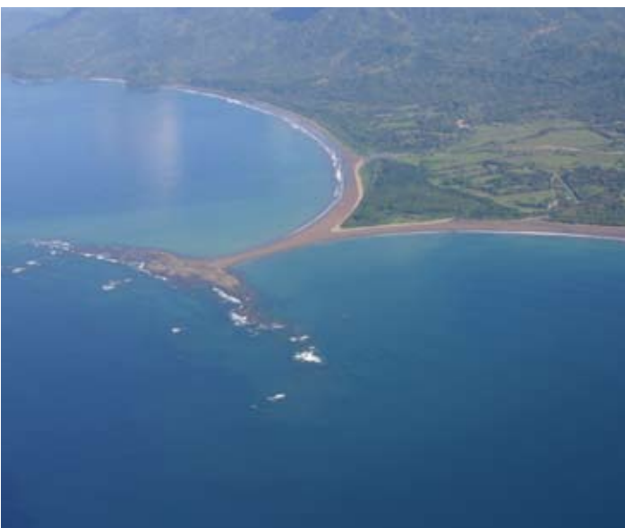
The sweeping and dramatic Playa Uvita

Playa Uvita beach, inside the park, is one of the top beaches in Costa Rica. It has miles of wide darker-sand beach, empty and pristine. Swimming conditions are near-perfect, with warm calm waters and soft sand. Mountain ridges and slopes, covered in lush rainforest, backdrop the beach. A projecting sandbar at the northern end of the beach forms the shape of a whale's tail at low tide. Sunsets here are spectacular, and worth waiting for.