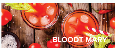
KETEL ONE BLOODY MARY $12.00 Ketel One Citroen vodka and our signature Bloody Mary mix