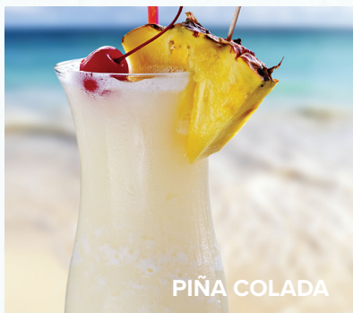
PIÑA COLADA $14.00 Cruzan Light rum blended perfectly with Island Oasis piña colada