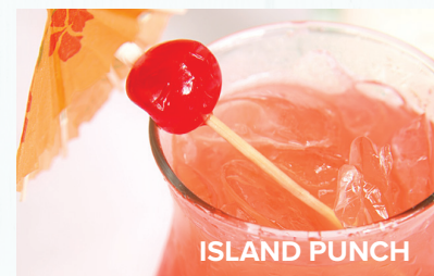
ISLAND PUNCH $13.00 Bacardi Rock Coconut rum, cranberry juice, citrus sour and grenadine