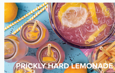
PRICKLY HARD LEMONADE $14.00 Ketel One Citroen, Deep Eddy Cranberry vodka, desert pear syrup, citrus sour and soda water