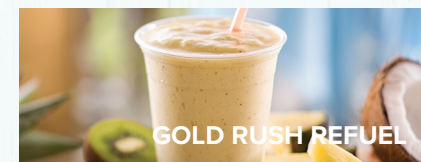
GOLD RUSH 🌱 $10.00 Coconut milk, pineapple and vanilla fat-free yogurt blended with ice