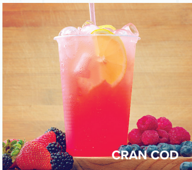
CRAN COD $12.00 Deep Eddy Cranberry vodka and soda water