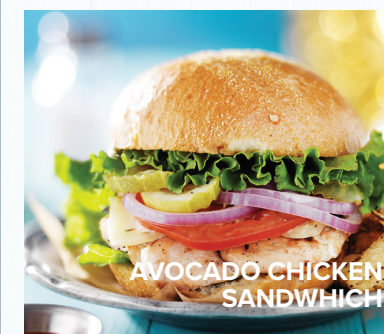
AVOCADO CHICKEN SANDWICH