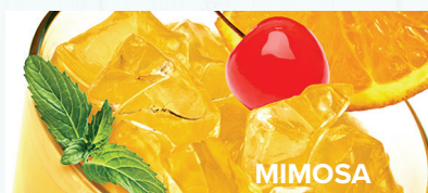
HOUSE MIMOSA $11.00 Freixenet sparkling wine with orange juice