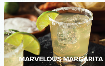
MARVELOUS MARGARITA $12.00 Sauza Gold tequila, fresh lime juice, citrus sour and a salted rim