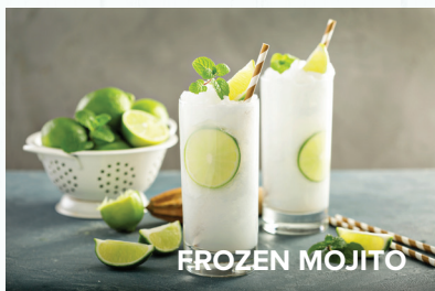
FROZEN MOJITO $14.00 Bacardi Lime rum, Monin mojito and margarita mixes blended