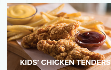
KIDS' CHICKEN TENDERS

10 years old & younger. Served with fries