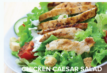
CHICKEN CAESAR SALAD