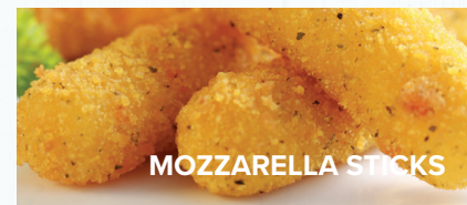
MOZZARELLA STICKS 🌱 $9.00 Fried mozzarella cheese sticks with marinara sauce