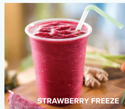
STRAWBERRY FREEZE $8.50 Island Oasis strawberry – a berry nice treat