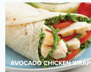
AVOCADO CHICKEN WRAP