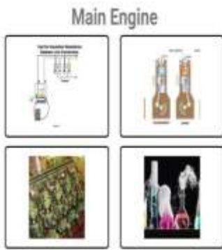
Fig. 2.2 The Quiz on vocabulary

When students come to the Quiz on vocabulary, they will see some pictures. They must select the best picture representing the title. In the next level of the Quiz on vocabulary the students are given some pictures and they are asked to type the definition of the object/tools shown in the picture. In this part, the students will learn how to write good sentences and good definitions.