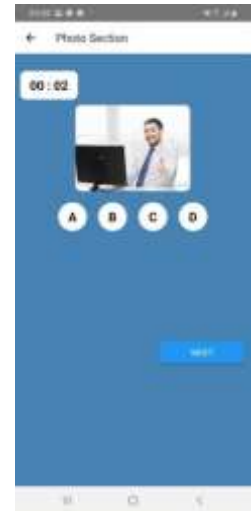
Fig 2.4 Photo Section

After the students finish listening to the photo section or pictures description, the student can continue the next part by choosing the 'next' button until they finish all parts of the test.