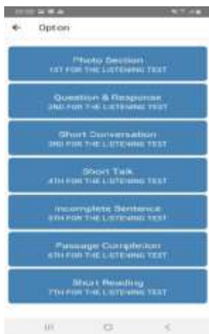
Fig 2.3 TOEIC Practices

The next option on the Quiz menu is TOEIC Practices. Here students are provided with a variety of TOEIC listening and reading practices.