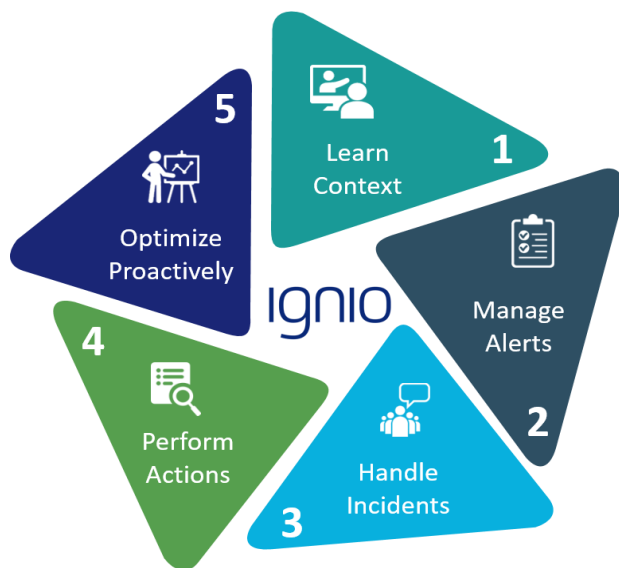
Fig. 1- Core capabilities of ignio™ AIOps