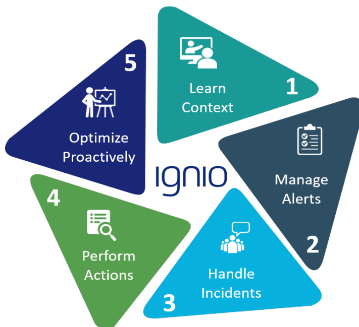
Fig. 1- Core capabilities of ignio™ AIOps