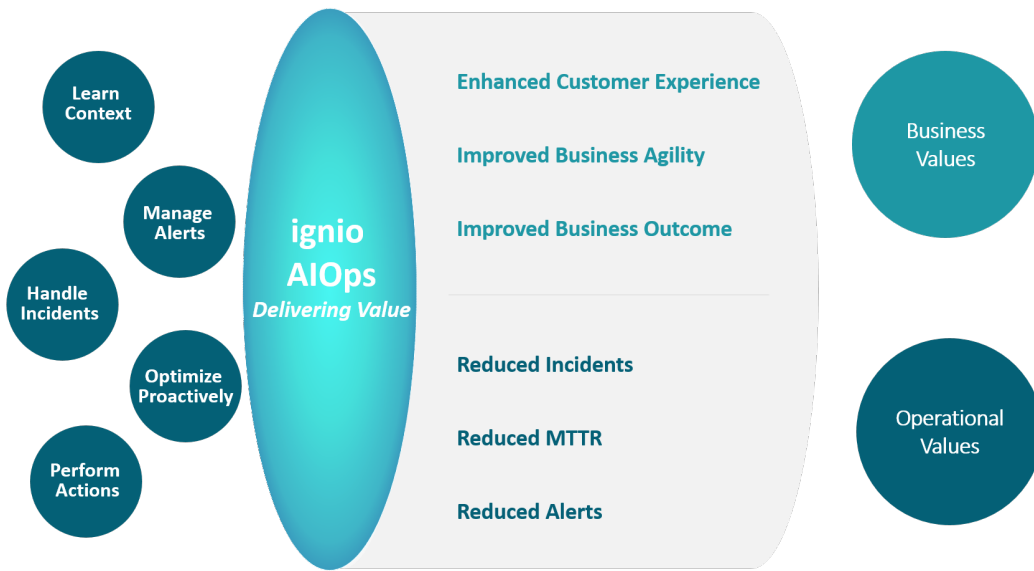
Fig. 2 - ignio™ AIOps : Translating Features to Customer Values