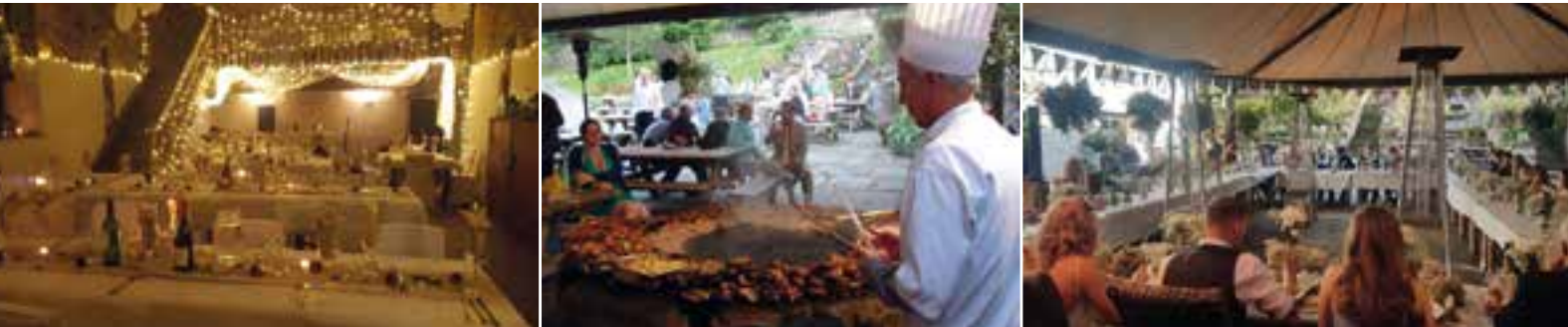
The perfect venue for your perfect day...

Bodafon farm park is located on the seafront in the resort town of Llandudno. We offer an idyllic country setting for rustic style weddings with stunning sea views from our sun terrace. The farm includes a traditional beamed stone Welsh barn for wedding ceremonies, same sex marriage, renewal of vows, naming ceremonies and also evening entertainment. Our restaurant and bar leads out to our courtyard garden with Italian canopy and outdoor BBQ. We can cater for up to 150 guests with a range of menu options from a traditional three course meal to our popular BBQ and buffets.