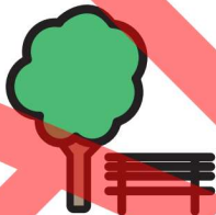
Visit a Park or a Museum