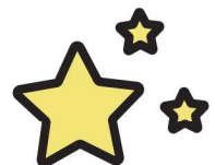
Tell your Librarian a fun fact about the Solar System

Bonus: Read an additional five hours to earn a special prize: an Admission Ticket to Dutch Wonderland! Color one block for each extra hour read.