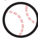
Go outside and do a Physical Activity