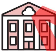
Attend a Public Library Event

If you complete one of these activities, then you can mark a blank box in the chart above.