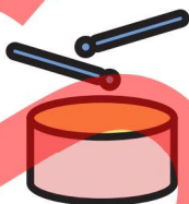
Make up or Learn a Song