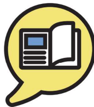
Listen to an Audio Book