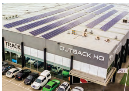
TRACK FACTORY AND MELBOURNE OUTLET OUTBACK HQ

From humble beginnings we have climbed to heights none of us could have imagined. We have endured and 'made hay' on the economic swings and roundabouts and continuously innovated, inspiring our customers and competitors alike.