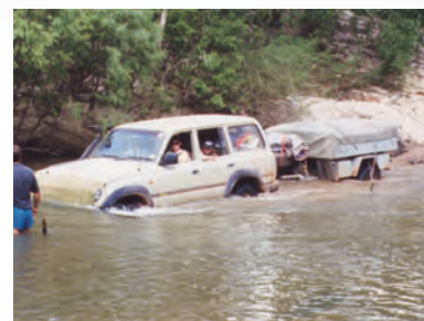
TRACK TRAILER EAGLE CAMPER