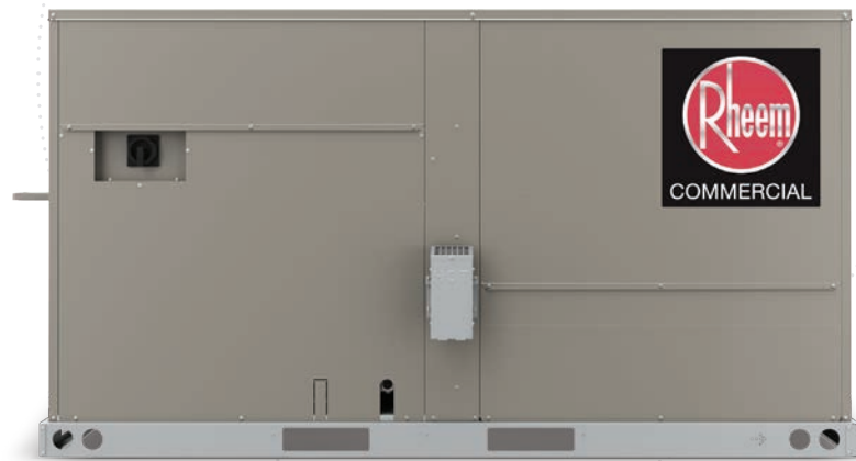
7.5–12.5 Ton Cabinet is Shown

A refined solution to make replacement, installation and service faster and easier.