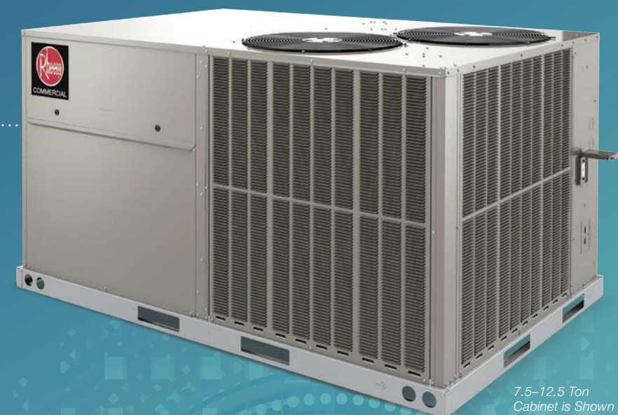
7.5–12.5 Ton Cabinet is Shown

With industry-leading efficiencies of up to 14.8 IEER, the Renaissance Line may qualify for a variety of utility rebates—helping your business realize substantial savings for a greater return on investment—at purchase and year after year.