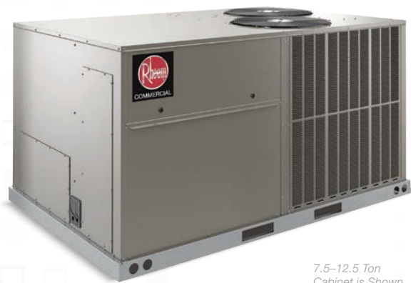
7.5-12.5 Ton Cabinet is Shown

:: customized solutions to help grow your business.