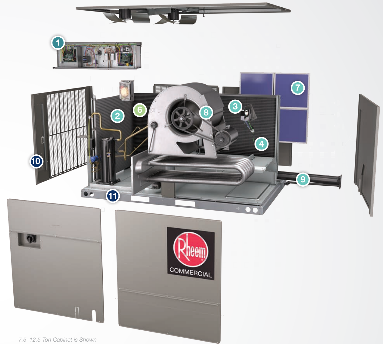
7.5–12.5 Ton Cabinet is Shown