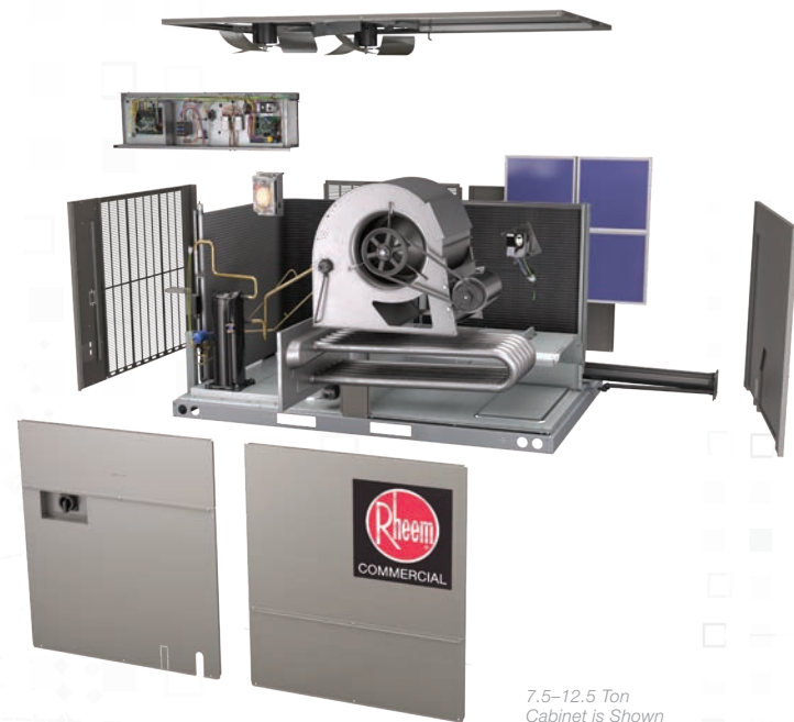
7.5-12.5 Ton Cabinet is Shown

From new construction to replacement projects and more, the new Rheem® Commercial Renaissance™ Line offers a breadth of commercial heating and cooling products that meet all design and application requirements. Whether your business is retail, hotels, restaurants, offices, schools, senior care or gyms, you'll have the ability to connect a new, customized Renaissance unit quickly and efficiently, providing comfort and peace-of-mind.