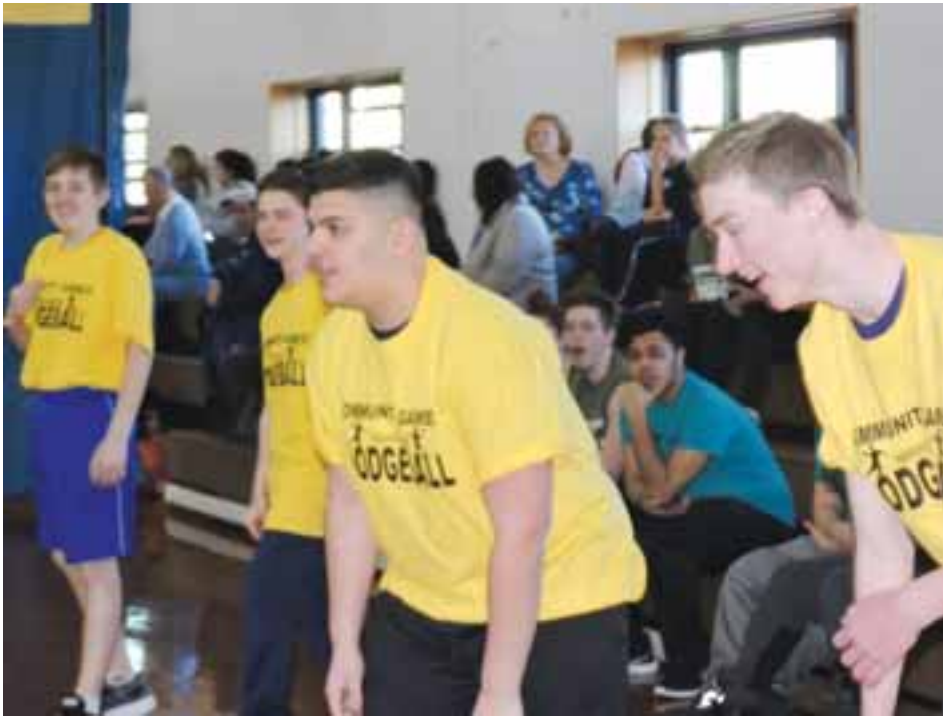
The first Norwood Dodgeball Tournament was a complete success, despite some audience members finding out what happens if you're a little unwary on a dodgeball court.