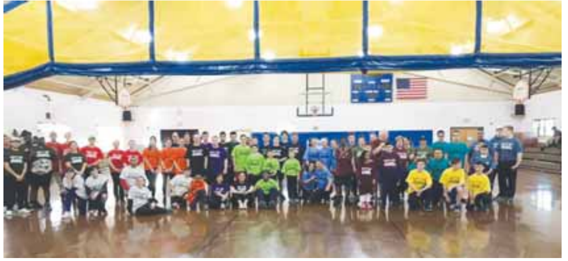
A total of 15 teams signed up for the first tournament and members from all sectors of the community came out to play some dodgeball.