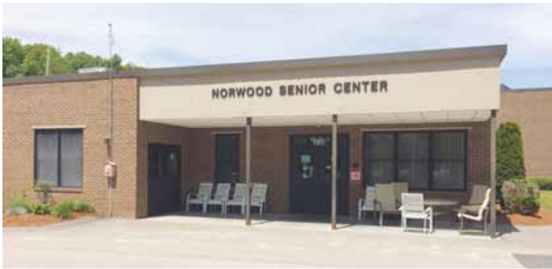
The Norwood Senior Center is gearing up for the spring and summer and, according to residents, they want a little bit more of a challenge in their workouts.