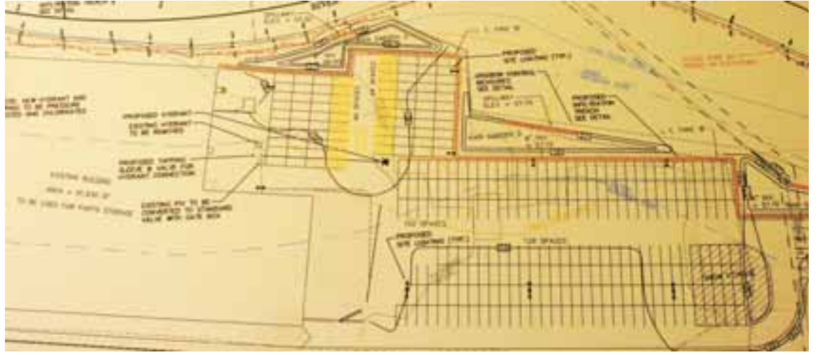
The Norwood Conservation Commission voted to accept plans with revisions that focused on the employee parking area, pictured here at the top left center.