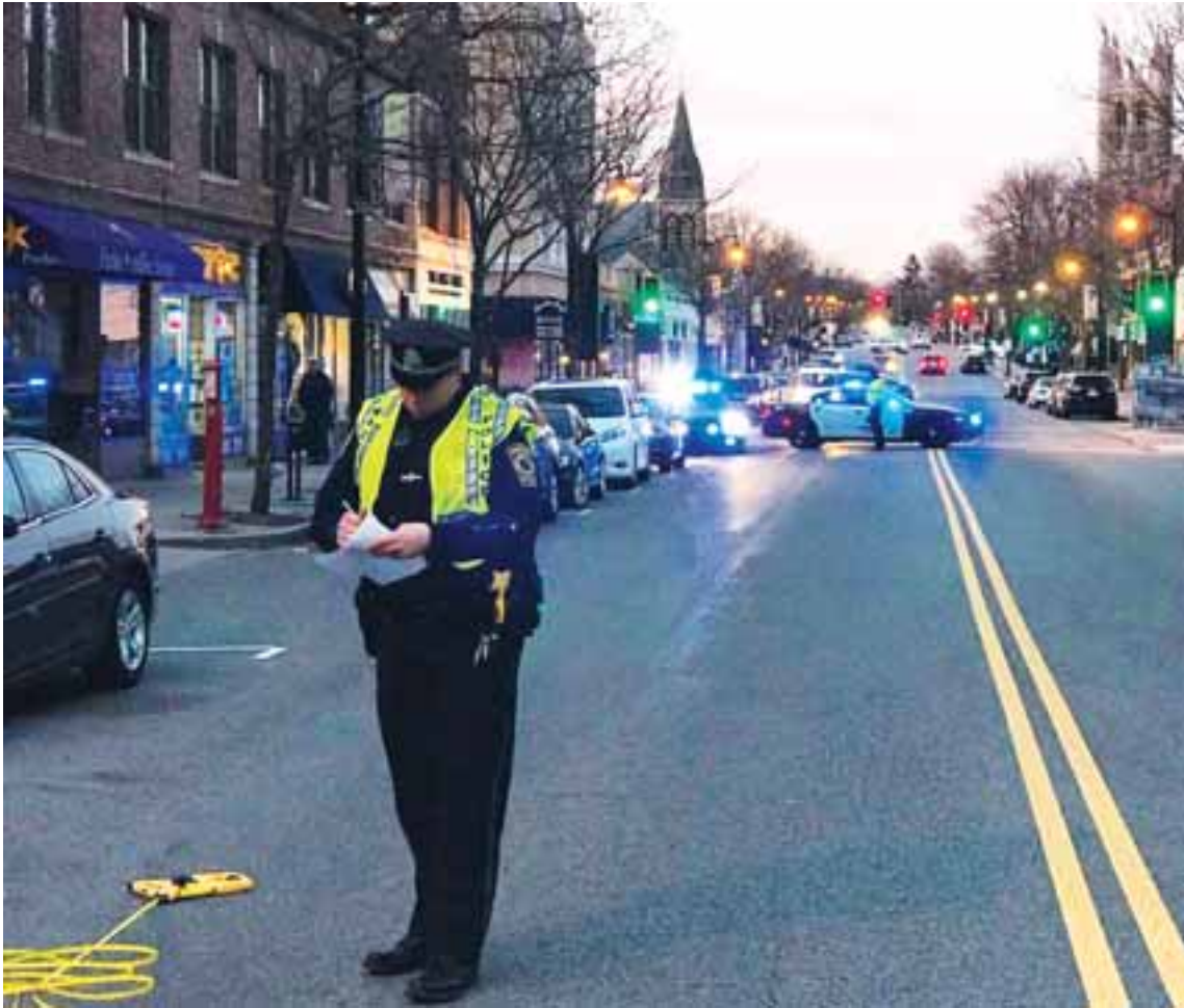
The Norwood Police Department spent Monday evening reconstructing the collision to aid in the investigation and prosecution of the case.