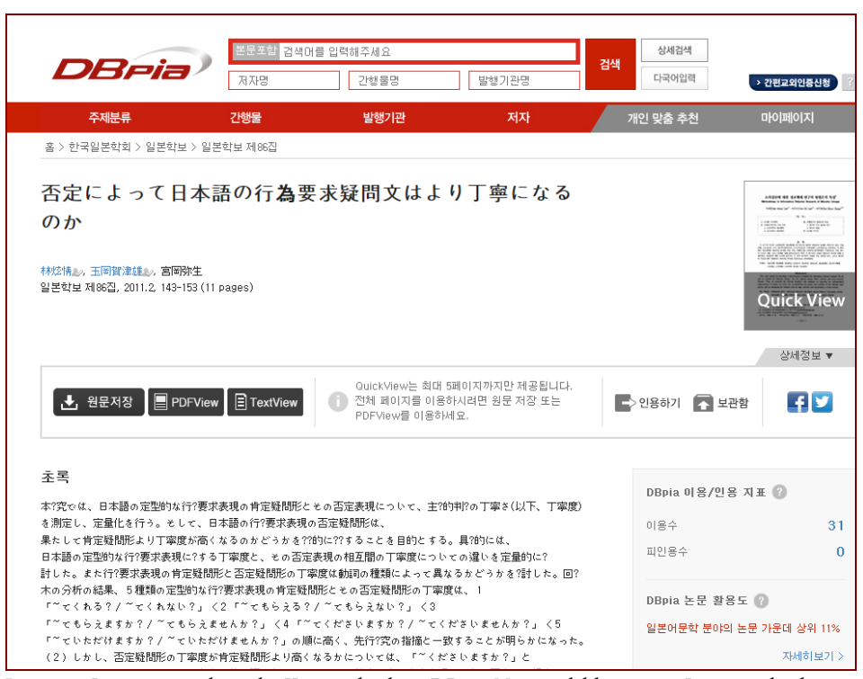
Picture 1: Japanese article in the Korean database DBpia. Not available to us in Japanese databases.