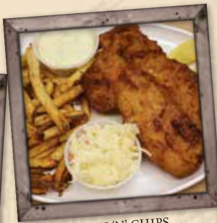
FISH 'N' CHIPS