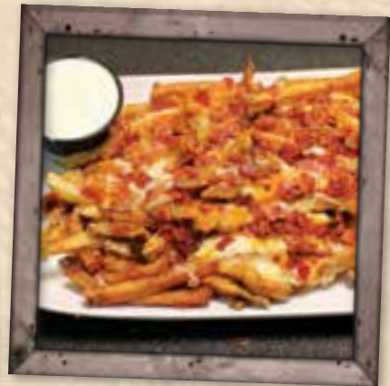
CHEESY BACON FRIES