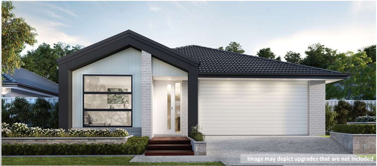
Image may depict upgrades that are not included

Floor area: 250.74m 2 / 26.99sq | Block Size: 1137m 2 Address: Lot 44 Howard Court, Kyogle