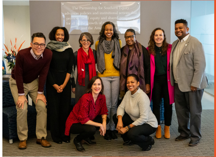
Philanthropic Trustees and Atlanta grantees

“I continually hear from organizations that Solutions helps to leverage the role of influencers for the field. Continuing to leverage and organize these influencers is a real added value.”