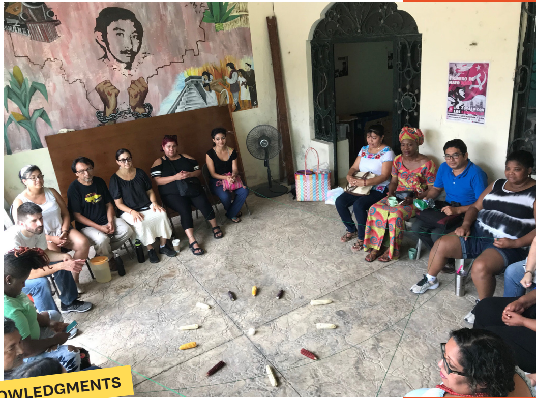
Fighter League retreat in Merida Mexico

Special thanks to The Solutions Project grantee partners, funders, trustees, consultants, and staff who shared their perspectives through key informant interviews and surveys.