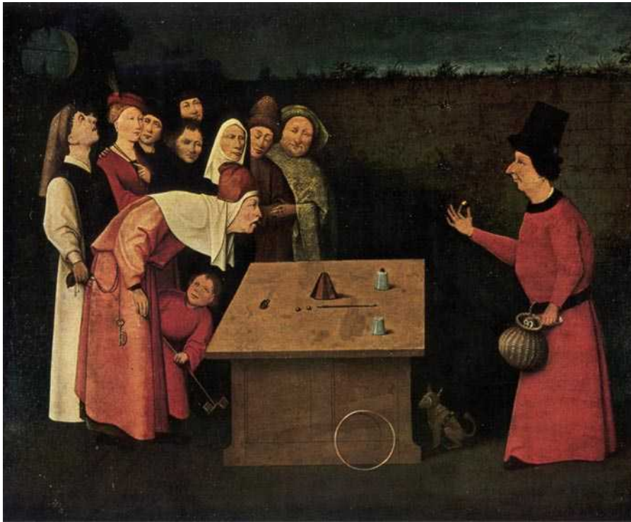
Figure 1 | The Conjurer, by Hieronymus Bosch. A magician performs for the crowd in medieval Europe, while pickpockets steal the spectators' belongings. The painting is in the Musée Municipal in St.-Germain-en-Laye, France.

(or Rubber Tree) illusion 8 , in which an oscillating bar (or rubber tree) seems to bend when it is bounced rapidly. The neural basis of this illusion lies in the fact that end-stopped neurons (that is, neurons that respond both to motion and to the terminations of a stimulus' edges, such as corners or the ends of lines) in the primary visual cortex (area V1) and the middle temporal visual area (area MT, also known as area V5) respond differently from non-end-stopped neurons to oscillating stimuli 8-11 . This differential response results in an apparent spatial mislocalization between the ends of a stimulus and its centre, making a solid object look like it flexes in the middle.