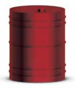
Solid Red - AX6 (S)*