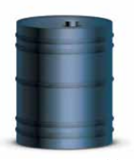
Starling Blue - B16 (M)