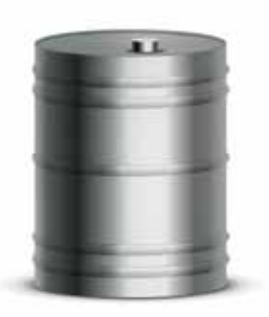
Bright Silver - KYO (M)