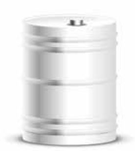
Arctic White - QM1 (S)