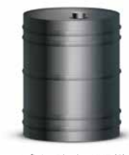
Infinite Black - KH3 (S)*