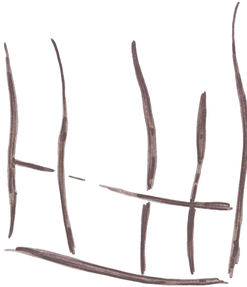
A Bear Track Symbol, common in Rock Carvings