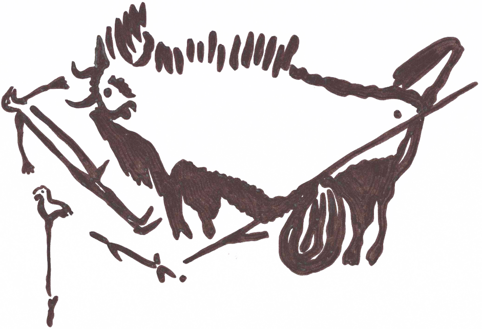
Le Puits in the Lascaux Cave (France)