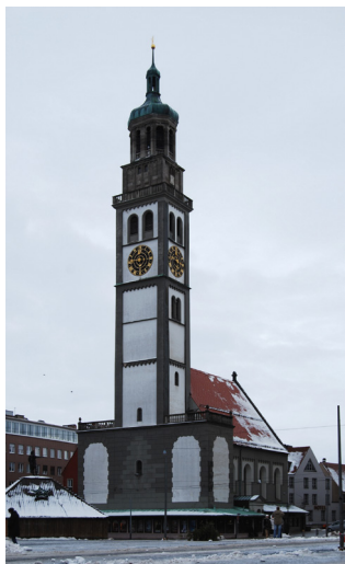
St. Peter am Perlach