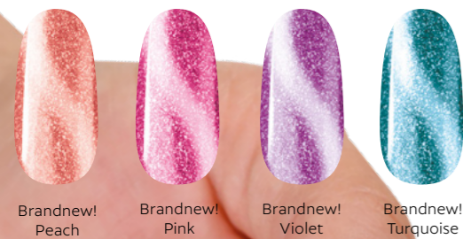
Brandnew! Peach Brandnew! Pink Brandnew! Violet Brandnew! Turquoise