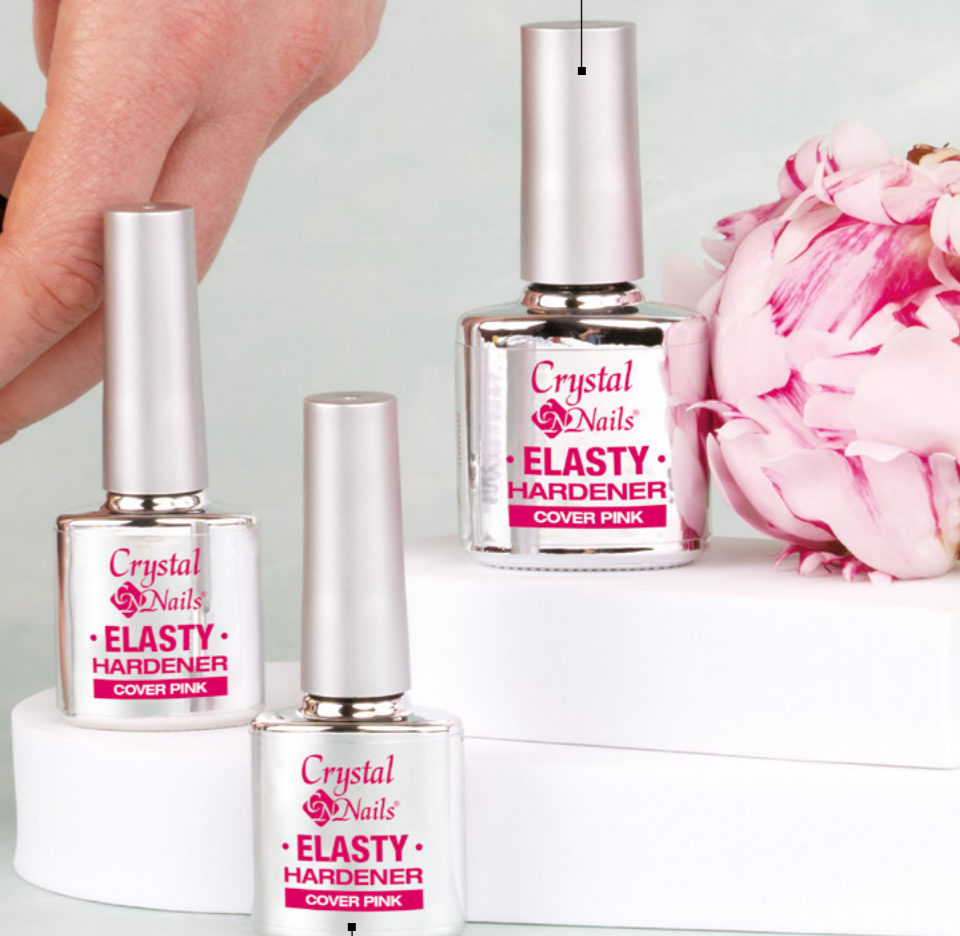
New color! Cover Pink