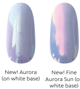
New! Aurora (on white base)