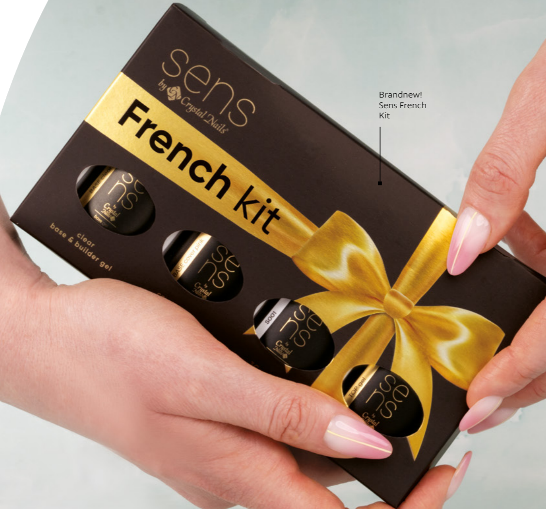
Brandnew! Sens French Kit