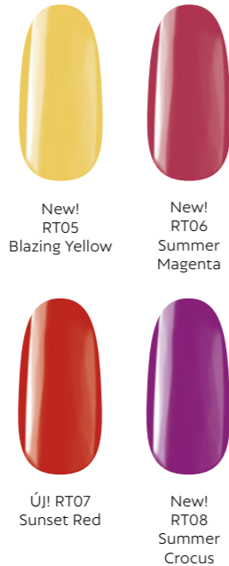
New! RT05 Blazing Yellow

The Royal Top Gels, which debuted in the spring, were really popular, so now we are coming with 4 new, bright, cheerful colors for the summer. Everyone will find their favorite from the two slightly understated and the two really vibrant shades! Royal Top Gel is a creamy, easy-spreading material, the softer version of Royal Gels in bottle packaging, which will become the new favorite of professionals. It covers in one layer, so it is faster to work with. It will be a pleasure to apply the colors to the nail surface. Non-fixing, non-dissolving, colored gel in a bottle. Curing time in UV 2-3 minutes, in LED 1-2 minutes.