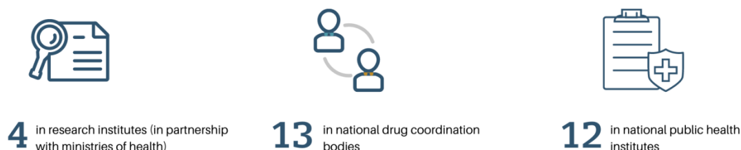
Figure 1 NFPs' parent institutions