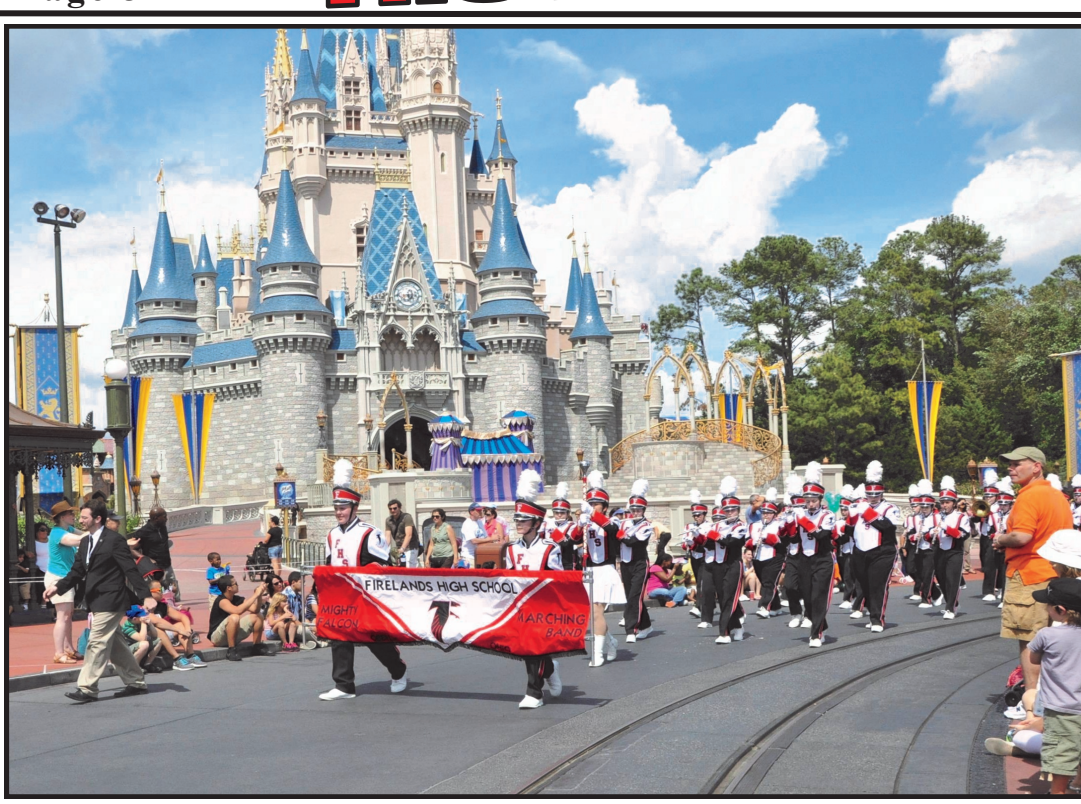
The Mighty Falcon Marching Band performed for the world in the Magic Kingdom at the Walt Disney World Resort.