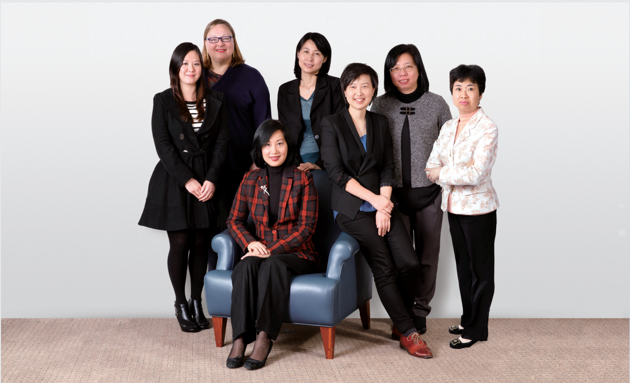
Standards and Development Department

Secretary: Assistant Director, Regulation & Guidance