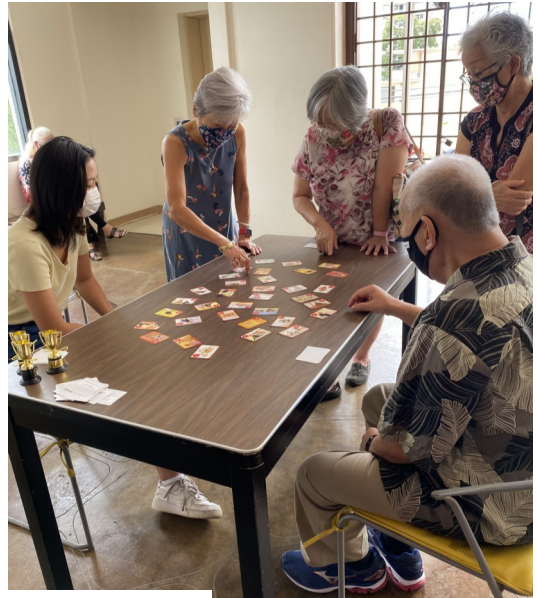
Happy Strummers & karuta on Mother's Day