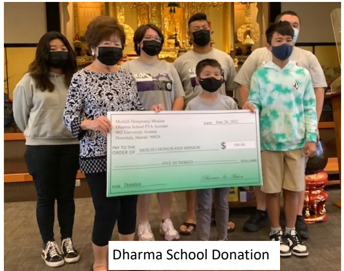
Dharma School Donation