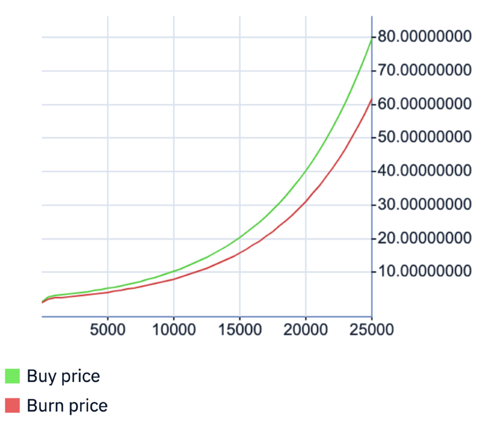
Price simulation (volume is 0.1% out of the current supply in each transaction)

GUARANTEED GROWTH OF THE BAEX BUYBACK PRICE