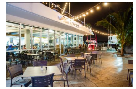
These are examples of outdoor seating allowed with social distancing.