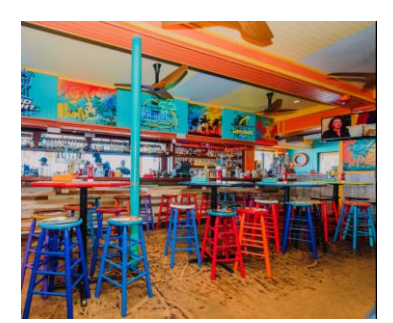
Allowed at tabletops