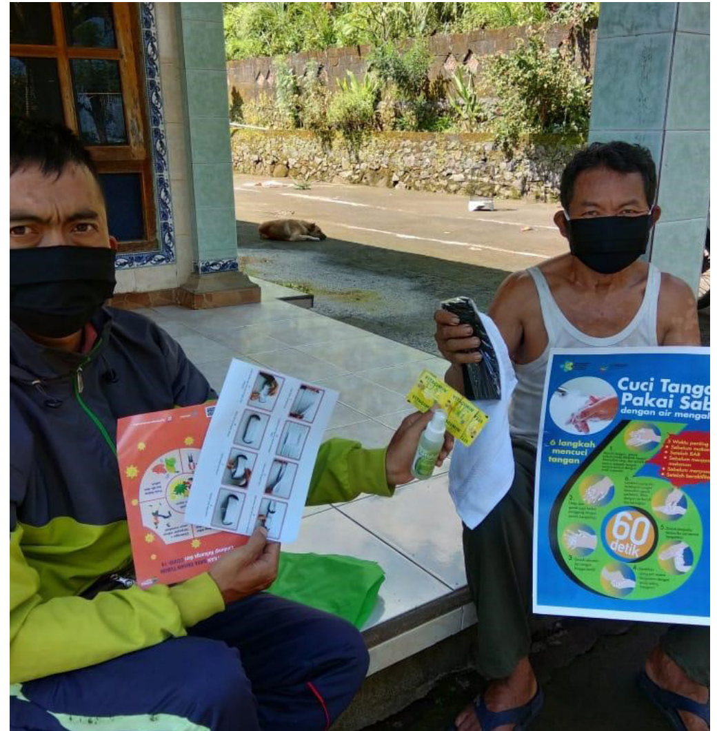
Participants in a training on hygiene in Indonesia