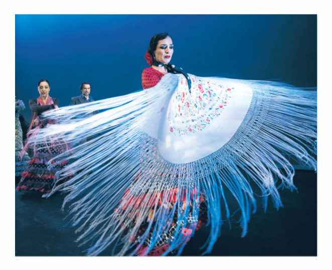
Flamenco Vivo is part of the new season's international subscription offerings at The Sharon.