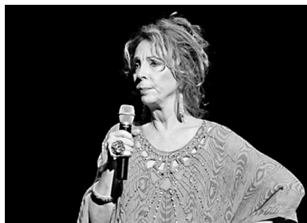
Comedian Rita Rudner, a Las Vegas legend, performs for a sold-out crowd in her first of two shows at The Sharon L. Morse Performing Arts Center on Thursday.