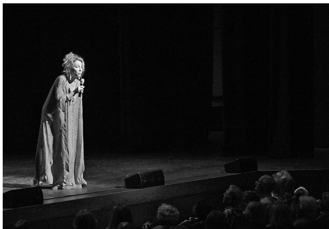
Comedian Rita Rudner, a Las Vegas legend, performs for a sold-out crowd in her first of two shows at the Sharon L. Morse Performing Arts Center on Thursday.