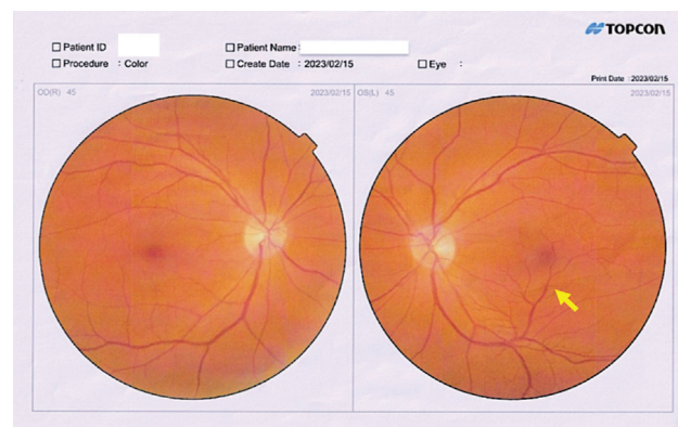
Fig. 1 Color fundus photographs of the right eye (OD) and left eye (OS), showing a left eye macrovesSEL.

Optical coherence tomographic angiography (OCTA; DRI OCT Triton plus, Topcon Medical Systems, Inc., Europe) was normal for the right eye. It detected no alterations, except for the presence of the macrovesSEL branching superiorly at the edge of the fovea, a vascular zone in the left eye ( Fig. 3 ).