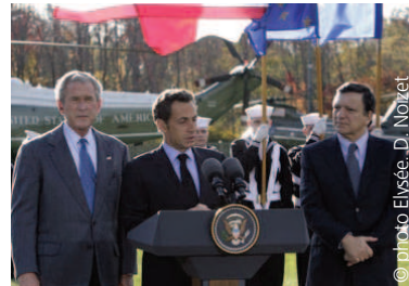
Presidents Bush, Sarkozy, and Barroso hold a joint conference at Camp David.

Mr. Sarkozy called on the heads of state and government to coordinate their efforts to