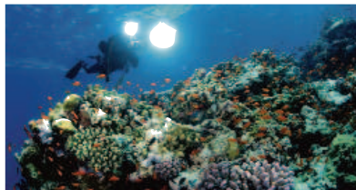
A researcher measures the deleterious effects of climate change on coral.

"A major focus needs to be shifted toward increasing the resilience of the system as a whole — that means reducing as many other locally derived threats as possible," lead researcher Nick Graham stated.