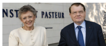
French Nobel Laureates Barré-Sinoussi (left) and Montagnier.

Françoise Barré-Sinoussi and Luc Montagnier earned the Nobel Prize in Physiology or Medicine in recognition of their identification and classification of the HIV virus in 1983, allowing scientists to prove the link between HIV and AIDS and develop medicines to combat the disease. "Our compatriots' work made a decisive contribution to mobilizing the international community to confront AIDS, in association with the individuals and communities affected and civil society," said Bernard Kouchner, French Minister for Foreign and European Affairs.