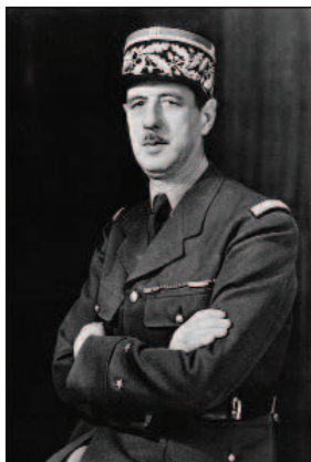
French WWII hero Charles de Gaulle's proposal for a new constitution was inaugurated on October 4., creating the Fifth Republic.

The Fifth Republic was founded as a response to the global social, political, and economic changes that occurred after World War II. Although the Fourth Republic is credited with rebuilding the nation's post-war industry and promoting European unity, its presidency was a ceremonial position, critics argued, devoid of concise decision-making ability on issues such as decolonization, and unable to provide a voice of direction. The National Assembly, the lower house of parliament, exercised the majority of the government's power, but no political party was able to secure a stable majority. Establishing consensus could be difficult and labor-intensive.