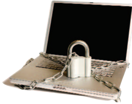
CNIL is taking measures to protect individuals' privacy against unsolicited and annoying e-mails.

One of these controls focuses on compiling a list of e-mail addresses of companies that have sent messages marked as spam by Internet users. Under the agreement between the CNIL and Signal Spam, the Authority will receive a list of the enterprises most frequently identified by those who consider themselves victims of undesired messages. The CNIL has already notified several of the flagged businesses,