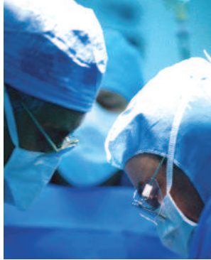
French surgeons used lasers for non-invasive treatments of brain tumors.

"This is the first time laser technology has been used in an