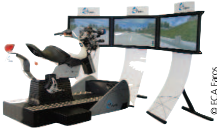
French company ECA Faros has donated driving simulators to the US Army for the training of American soldiers.