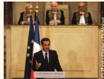
President Sarkozy addressed the Academy of Moral and Political Studies on October 7.

The Fifth Republic's 50-year anniversary provided ample opportunity for French leaders to honor the constitution and discuss its value today. The Charles de Gaulle Foundation hosted a colloquium with the Institute of France on October 4, gathering scholars and juris doctorates to explore the origins of the constitution and its relationship with international law. In addition, former prime minister Edouard Balladur and former cultural minister Jack Lang visited the prestigious Institute of Political Studies on October 5 to debate the role of the president, parliament, and individual citizens in the modern political system.