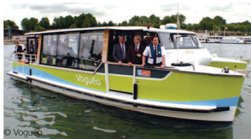
Voguéo offers river views to commuters.

Large blue and green catamarans began sailing down the Seine this summer — but instead of T-shirt-sporting tourists carrying cameras, the passengers are suit-clad businessmen holding briefcases.