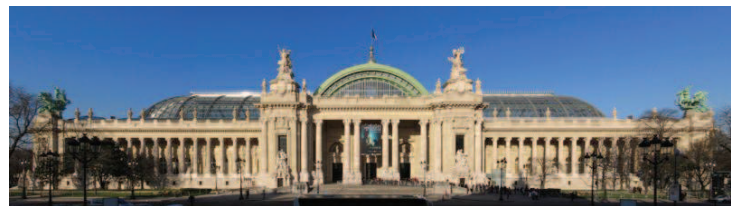
The CAPE has moved its headquarters to the Grand Palais, which was first used for the 1900 Paris World Fair.

Since it opened at the Radio France building, the CAPE has hosted nearly 2,000 press conferences concerning European affairs, domestic politics, protection of the