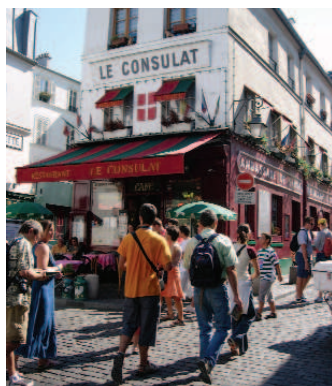
Friendly locals offer tourists an intimate view of Paris free-of-charge.