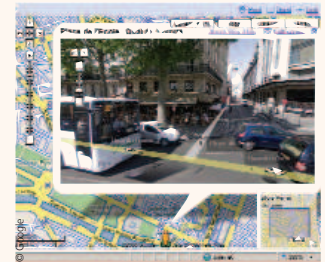
Google Street View provides panoramas of cities in France.

Using satellite imagery, Google Earth allows users to map locations and explore cities, regions, and even galaxies in vivid color. This month, France became the first European nation to take the Google Earth technology to the street. The application "Street View" will permit tourists and locals alike to take a virtual stroll through French cities. Street View allows users to zoom in on a particular block and view a 360 degree panorama at street-level. In selected areas, photos are available at the end of each block, at every intersection, and important buildings feature multiple snapshots. Special markings alert users to landmarks along the "walk," and clicking on a marking will redirect the user to online encyclopedias for additional information. With the help of the Parisian Bureau of Tourism and French companies TVtrip and Drimki, Street View navigators can view detailed Parisian metro routes as well as explore hotels and their rooms prior to booking. Approximately 20 engineers spent two years photographing cities from every angle before launching Street View in: Paris, Lyon, Marseille, Lille, Toulouse, and Nice.