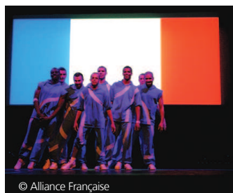
French hip-hop troupe Pockemon Crew blends elements of American hip-hop and French urban culture.

French and American authors, musicians, artists, and speakers came to New York City this October for the "I Kiffe NY" festival, a new exposition celebrating French-American urban artistic and cultural achievements through a variety of events. The Arabic word kiffe , which means "to adore," was first used in French cities by members of the Maghreb community and has since spread throughout the country.