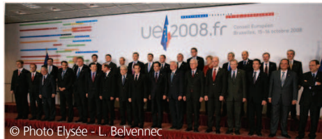
The E.C. signed the European Pact on Immigration and Asylum on October 16.

The European Pact on Immigration and Asylum, spearheaded by French President Nicolas Sarkozy, was enacted in mid-October by the European Commission. Backed by EU ministers at the Justice and Home Affairs Council meeting in Cannes on July 7 (see NFF 08.07), the agreement proposes common approaches for the 27 EU member states to curb the rise of illegal immigration, facilitate legal migration, and