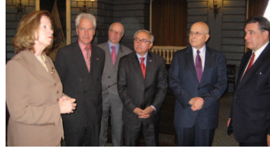
Stavros Dimas, second from right, visits the Massachusetts State House.