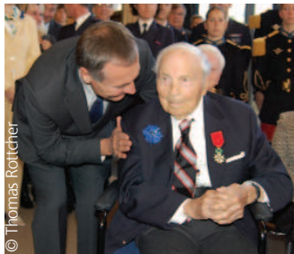
Secretary Bockel speaks with Frank Buckles at the Oct. 7 ceremony.

On October 7, French Secretary of State for Defense and Veterans Jean-Marie Bockel named Frank Buckles, the oldest surviving American soldier of World War I, an officer in the Legion of Honor at the Embassy of France in Washington, D.C. During the ceremony, Mr. Bockel thanked Buckles, now 107 years old, for his sacrifice and assured him that France would never "forget the blood spilled by the children of America."