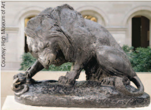
Antoine Louis Barye, "Lion with Serpent," 1832-1833. Bronze, 53 1/4 x 10 1/8 x 37 1/8 inches. Louvre Museum, Paris.

"Evolution" will also feature three rotations of focused installations. The first will include a Romanesque marble capital depicting the biblical story of Daniel in the Lion's Den and the early Greek