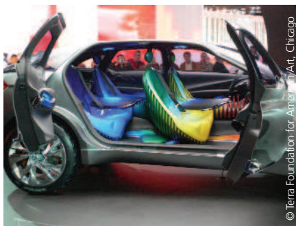
During the 2008 Paris Motor show, car manufacturer Citroën presented Hypnos, its colorful hybrid utility vehicle.

Fuel efficiency was the feature du jour in Paris, in light of environmental concerns and strained financial markets. The October exposition marked the motor show debut of Chevrolet's plug-in hybrid, Volt, slated for release in 2011. Honda, too, announced its entry into the gasoline-electric market in Paris, where it revealed the prototype of its Insight. The latter is marketed as a new model of an affordable, family-oriented hybrid. French manufacturer Citroën also displayed its colorful concept sport utility hybrid, Hypnos. In addition, smaller cars