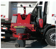
The "robotic arm" collects a trash can.

ROBOTIZED TRASH COLLECTION A French company is using technology to make garbage collection