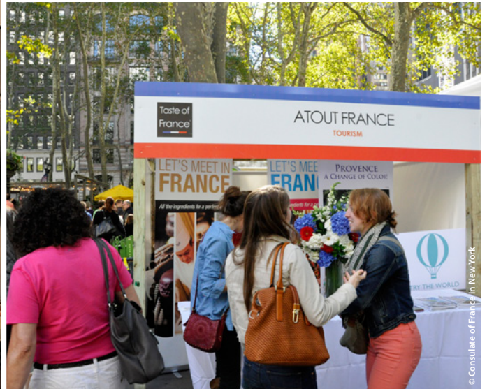
© Consulate of France in New York