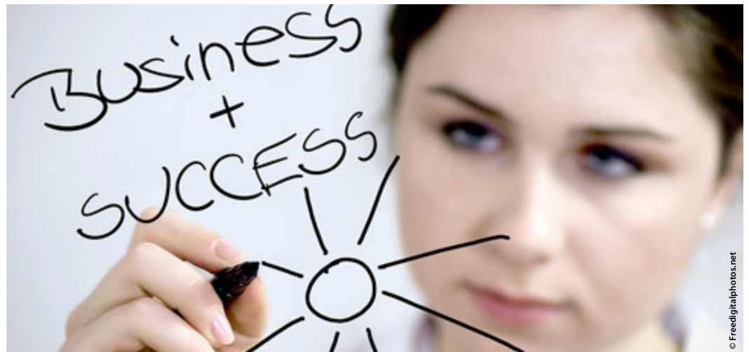
Entrepreneurship should be “a path that is open to women as much as it is to men,” says Innovation Minister Fleur Pellerin. The new project, unveiled on August 27, aims for a 10-percent jump in entrepreneurship by 2017.

The government’s long-term goal is to increase the number of women entrepreneurs in France from 30 to 40 percent by 2017.