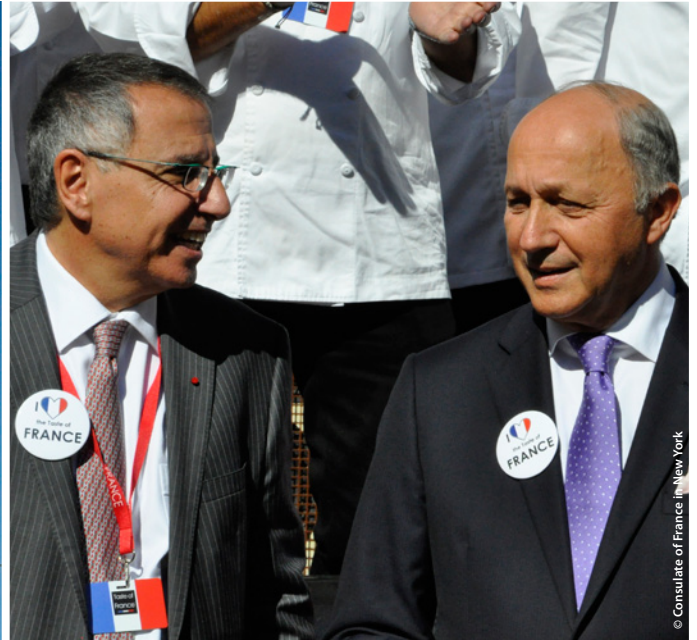
© Consulate of France in New York