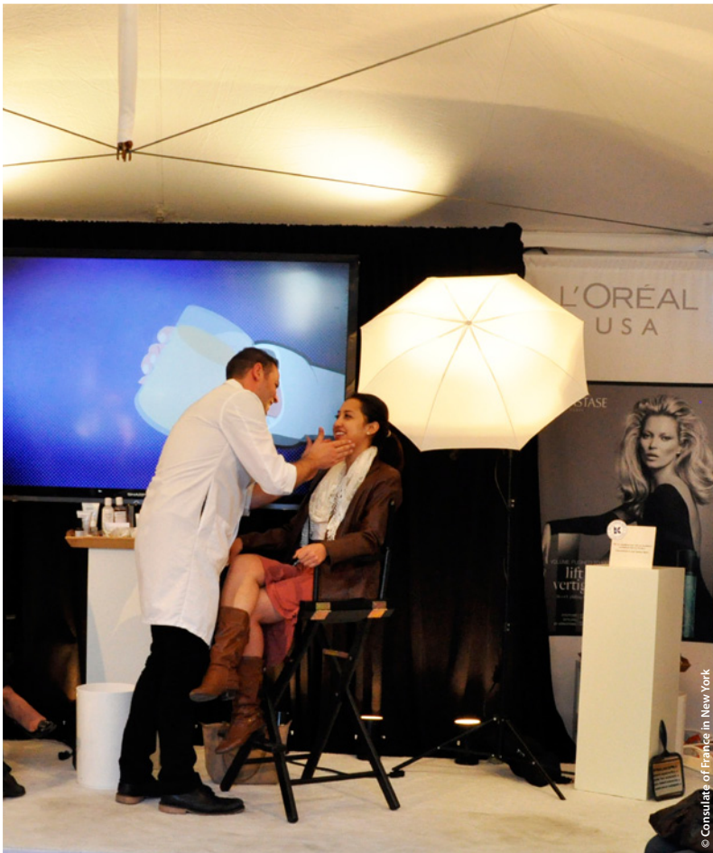
© Consulate of France in New York