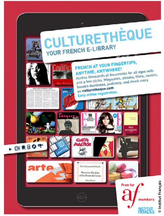
Culturethèque offers French-language learning tools as diverse as comic books and traditional food recipes.

Some of the latest additions to Culturethèque USA include Le Combat Ordinaire , a comic book about a boy who escapes the suburbs of Paris for the countryside, and a video of the Algerian-French Orchestra performing French composer Camille Saint-Saëns. For mystery lovers, the platform recently added Les Âmes Grises , or "Gray Souls," about a little girl who goes missing.