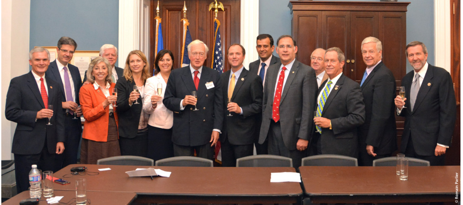
The Congressional French Caucus met on September 19. L-R: Robert Latta, Amb. François Delattre, Dana Titus, John Larson, Sylvie Goy-Chavent, Catherine Troendlé, Roland du Luart, Adam Schiff, Philippe Kaltenbach, John Boozman, Jean Bizet, Joseph Wilson, Michael Michaud, and John Campbell. For full story, please see p. 2