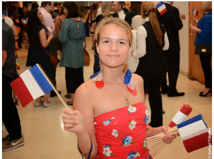
Clockwise from top left: An Eiffel Tower replica graces the Milwaukee skyline, where “Bastille Days” attracted over 200,000 visitors; would-be peasants throw candy to the masses in Philadelphia; a reveler stops for a photo at the French Embassy in Washington; and French delicacies tempt attendees at an LA Alliance Française party.

lution and its main historical figures added another layer of comedy and fun to the performance. The combination of song, dance, and reenactments provided historical background intended to amuse the audience. The theatrical performance featured appearances by Edith Piaf, Napoleon, Joan of Arc, Benjamin Franklin, and a somewhat more dubious period actor dressed as a baguette.