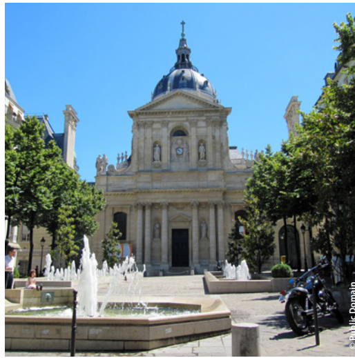
French schools like the Sorbonne (above) attracted nearly 289,000 foreign students last year, according to UNESCO.

"The United States and France believe student mobility contributes to our strong alliance and is essential to expanding global knowledge and economic growth," the