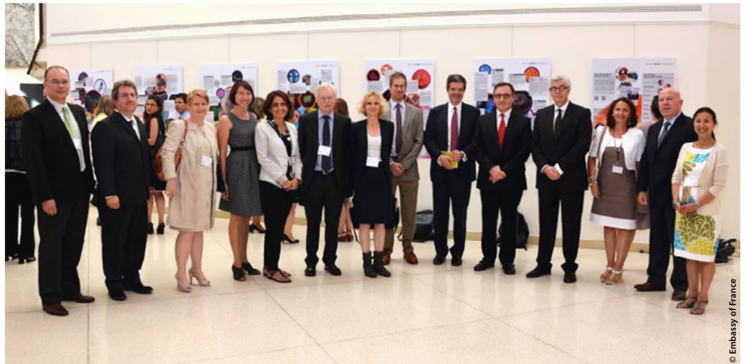
The Networking Event in Science and Technology (NEST), an annual conference held at the Embassy of France in Washington, brings together French and U.S. administrators, scientists, and researchers for best practice exchanges.

▲ The Embassy of France hosted a special gathering for the best French and American minds in science and technology during the annual NEST conference, held on July 1. NEST's two-part conference celebrated the 50th anniversary of Inserm, the French National Institute of Health and Medical Research. A public research institute founded in 1964, Inserm operates under the joint authority of the French Ministry of Health and the French Ministry of Research.