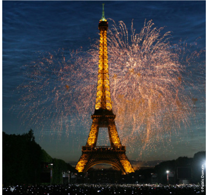
Every year, July brings to France and the United States the chance to celebrate each country's most important national holiday. Left, fireworks light up the sky in Washington, celebrating a nation's independence secured in part by French assistance during the Revolutionary War. Right, the Eiffel Tower on Bastille Day 2014.