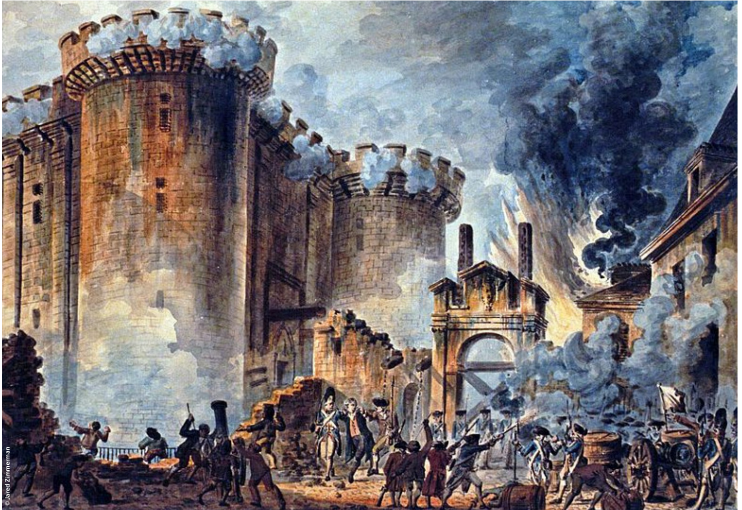
In "The Storming of the Bastille," a painting by Jean-Pierre Houël, viewers can imagine the chaotic first moments of what would spark the French Revolution. The act of overtaking the structure, a prison and a symbol of misgovernment by the French monarchy, would ultimately lead to the democratic system France enjoys today.

A part from the usual celebrations, soirées, and restaurant events, Bastille Day, France's largest national day which is celebrated every July 14, saw some new and creative shows of enthusiasm in the United States. The holiday marks the 1789 storming of the Bastille prison in Paris that sparked the French Revolution and France's transition to democratic government.