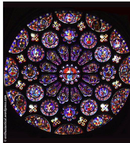
The AFC has raised $50,000 toward bringing stained glass like the Chartres rose window (above) to the U.S. public.

▲ The American Friends of Chartres (AFC), a non-profit organization that supports the famous Chartres Cathedral in France, launched a crowdfunding campaign on July 14 to restore a 20-foot high medieval stained-glass window and exhibit it in the United States. AFC board members hope to display 13th-century stained glass from Chartres to the American public for the first time.