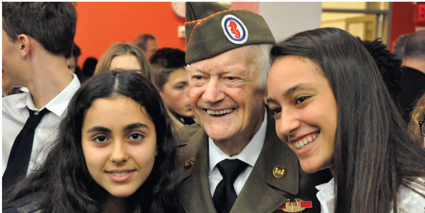
On November 11, students from the Lycée Français in New York attended a ceremony to honor veterans from World War II that were awarded the Legion of Honor by the Consul General of France in New York. For the full story on Veterans Day activities at the Embassy and Consulates throughout the U.S., see page 4.