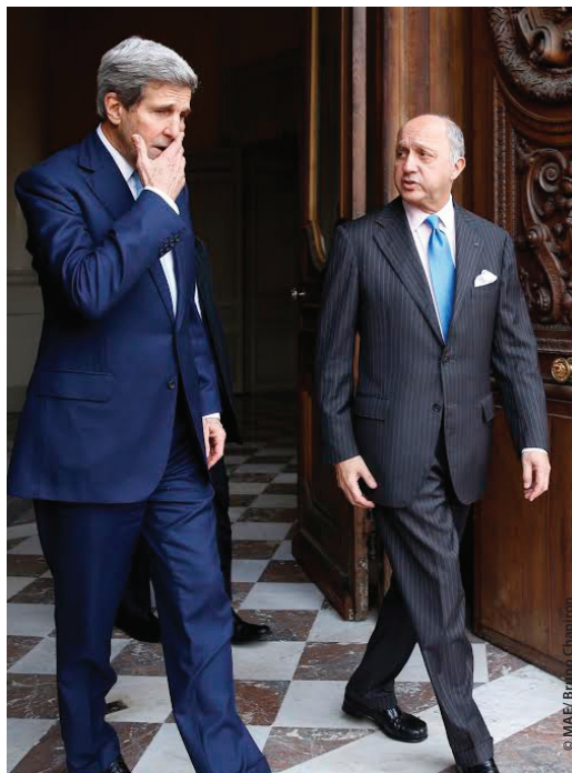
Secretary of State John Kerry with Minister of Foreign Affairs and International Development Laurent Fabius in Paris.

Minister of Foreign Affairs and International Development Laurent Fabius hosted his counterpart, Secretary of State John Kerry, in Paris on November 20. During the meeting, the leaders talked about recent developments regarding the coalition fighting Daesh (ISIL) in Iraq and in Syria, the situation in Ukraine and tensions in Jerusalem after the attack of a synagogue.