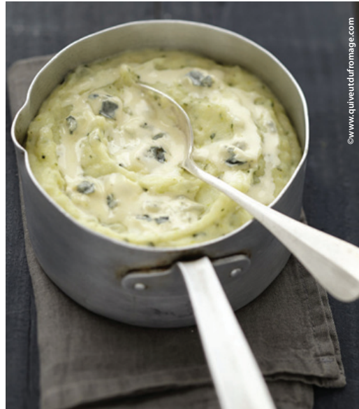
Julia Child's recipe for "Purée de Pommes de Terre à L'ail" is a French take on classic mashed potatoes.