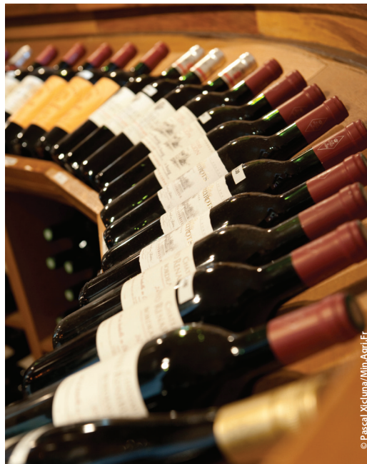
A display of a variety of French wines. The wine sector attracts more than 10 million people to France each year.

▲ According to the International Organization of Vine & Wine (OIV), France will take the top spot as the world leader in wine production for the year 2014. France has regained the title, previously held by Italy, which had been the top producer since 2011. France is expected to