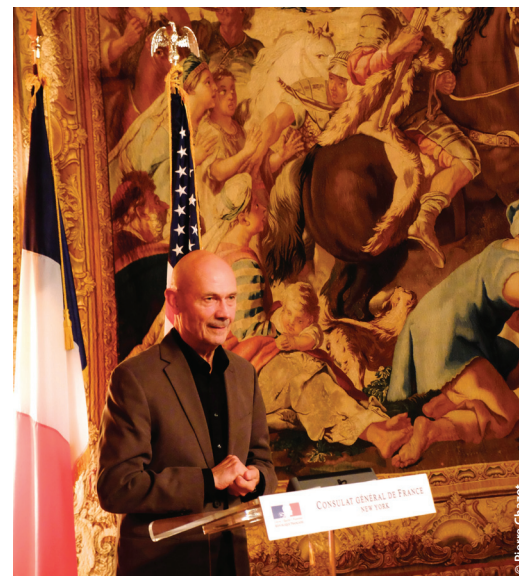
Pascal Lamy, former European Trade Commissioner and head of the WTO, spoke in New York on November 4.

Lamy argued that the United States and Europe are the best candidates for the trade agreement because in both cases, countries’ welfare programs can benefit from economic growth and increased trading opportunities. He also said that opening trade between the regions creates opportunities for U.S. and European im-