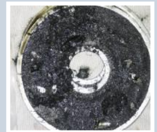
Wear in filters, prior to change out