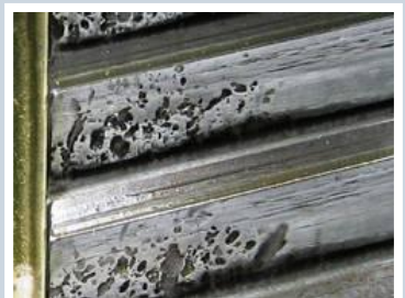
Pittings stabilised during the use of Addinol Ecogear