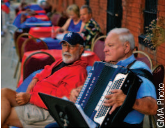
Accordion music sets the tone for Bastille Day in Minneapolis.