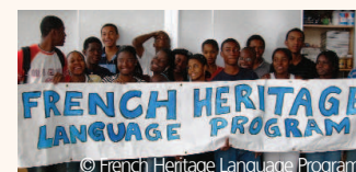
American teenagers partake in the French Heritage Language Program in New York City.

The all-night festival's name was inspired by the silvery grunion fish that live in local waters and come ashore in waves a few times a year to spawn in the sand, producing a momentary iridescence. For more information, please visit: www.glowsantamonica.org .