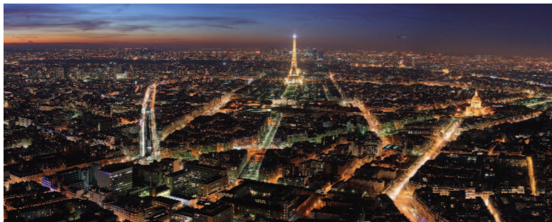
View of Paris, at dusk, from the Maine-Montparnasse tower — President Sarkozy called on architects to modernize the city's transportation system and to reduce its ecological footprint.

French President Nicolas Sarkozy called on ten architects, with teams of urban planners, engineers, sociologists, and even philosophers, to create proposals to modernize Paris's transportation systems and to further advance the city's commitment to sustainable environmentally-friendly development and to lowering its ecological footprint. At the Elysée Palace in early June, President Sarkozy gave each team six months to create "strong, original, and real" proposals that would accommodate the expansion of the metropolis and address global concerns about energy resources and climate change, making Paris a model of sus-