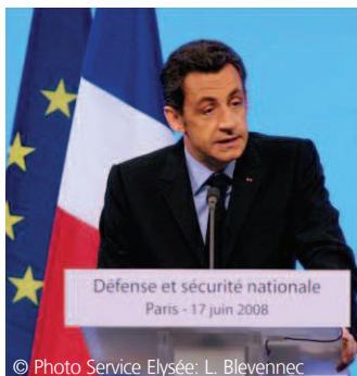
President Sarkozy announces the conclusions of the White Paper.

Additionally, the new strategy emphasizes the highest degree of professional development in all sectors, both civilian and military. As much as possible, joint training and shared recruitment policies of various ministries will be implemented. A special educa-