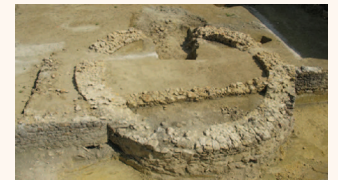
An aerial view of the 40 foot diameter tower dating back to the 13th century.

The French National Institute of Preventive Archaeological Research (INRAP) has unearthed relics from the 13th century Château de Chaland in Essonne, near Paris. The Institute's archaeologists, who have been excavating since January, discovered the remains of a tower (photo above) that was nearly 40 feet in diameter, leading them to believe that the owner had some very powerful, and possibly royal, connections. The site also includes a farm, a fortified structure, a trench, and an expansive dwelling space, as well as a weaving workshop. The discovery of the farm confirms theories that farming did exist as early as the 13th century, according to INRAP—grain collecting and animal husbandry were essential forms of sustenance as early as medieval times. Verifying the assumption that the castle's owner may have been a squire or a knight was the discovery of shards of glazed and decorated dishes and pitchers. These ceramics are believed to have been brought from Parisian workshops and are considered to be a good indicator of wealth and rank. Using the remains, contemporary maps, and aerial pictures from the 1920s, the Institute has been able to not only get an idea of the original layout of the site, but also to trace its development over the centuries.