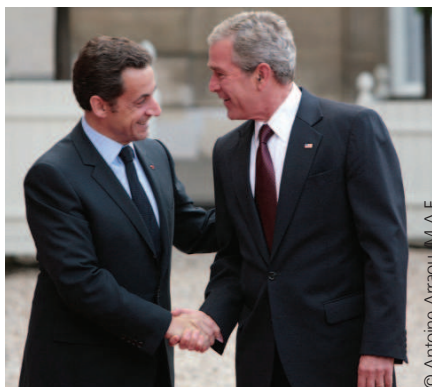
President Sarkozy welcomes President Bush at the Elysée Palace on June 13.

Elaborating on French-American friendship, President