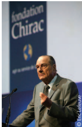
Former French president Jacques Chirac launched his foundation in June.

Former French president Jacques Chirac launched his foundation dedicated to sustainable development and cultural diversity last month, demonstrating his continued commitment to international development and to the creation of a dialogue between peoples around the world.