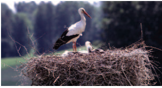
"Max," the stork, nesting with his young on the French-German border.

The population of the white stork has increased by 3,000 percent thanks to protection and reintroduction programs in Alsace and Lorraine, saving the iconic bird that makes annual migrations from France's northern Rhine region to Africa's Sahel Belt. The white stork, commonly associated with fertility and good luck, was nearly extinct during the early 1980s due to droughts in Africa that depleted winter food supplies and obstacles during flight such as power lines. In 1983, France's Association for the Protection and Reintroduction of Storks initiated one of the most successful repopulation programs, keeping young storks in enormous aviaries for at least three years and feeding them plentiful meals to discourage instincts to make the yearly journey to Africa. In addition, the national electric company developed special screens to keep birds from nesting near power lines, school children shored up deteriorating nests between breeding seasons, and "stork correspondents" were appointed to every town in the region, recording the movements of the birds and the conditions of their nests.