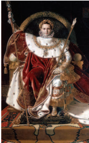
"Napoleon on his imperial throne," Ingres, Jean Auguste Dominique.

New evidence from Italy's National Institute of Nuclear Physics (INFN), however, has called the poisoning theory into question. Researchers used a small nuclear reactor at the University of Pavia to