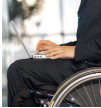
France's new social reforms will seek to improve employment opportunities and accessibility for the handicapped.

persons into the workplace. To this end, the French government will systemize cooperation between La Maison départementale des personnes handicapées (a unique public institution, created in