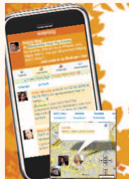
Weplug.com can be used in tandem with the iPhone.

In addition to the usual online features, weplug.com integrates geolocation and the micro-blogging service Twitter into its interface. Geolocation is a fairly new, hip application — once users give their permission, the site works in tandem with the iPhone and Google Maps,