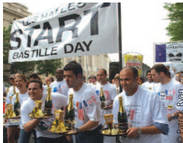
Waiters in Washington, D.C., prepare for the annual race.