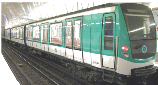
Paris's economically- and energy-efficient MF 2000 will bring new meaning to the term "green" metro.

The new models feature bigger windows, soft lighting, and colorful fabric upholstery. Other amenities to boost comfort include larger automatic doors to facilitate the train-to-platform transfer and an air-cooling system that is more economically- and energy-efficient than traditional air conditioning. One of the most important innovations, however, is the projected 30 percent decrease in energy consumption for the fleet. To reduce energy usage, the trains will have a lower maximum velocity, translating to fewer bursts of speed but more power when leaving each station, a method more suitable for the Parisian metro's network of closely placed stops.