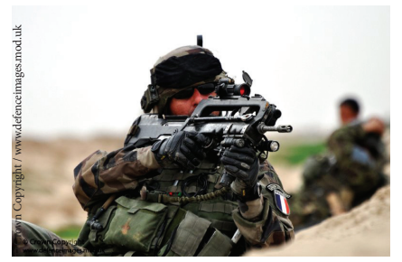
A Legionnaire scopes out his target while on patrol in Afghanistan.

Today, soldiers go into the field equipped with the latest military technology. Foot soldiers have begun to carry the first Félin (fantassin à équipement et liaisons intégrés), a portable bulletproof computer equipped with night vision, that enhances commu-