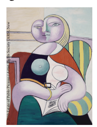
Reading, Painted in 1932, is an example of Picasso's dialogue with surrealism by metamorphizing people into shapes.

The Musée National Picasso created the international exhibit that showcases many of their staple collection pieces while it is undergoing renovations until 2012. Born in 1881, Picasso began studying art in