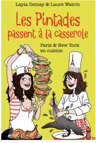
The latest book from French social writers Les Pintades is the first with a culinary focus.

Although Les Pintades guides are written by women, about women, Watrin and Demay are quick to point out that men can, according to the authors, "glean a practical aspect from the guides that is intended as much for them as for women."