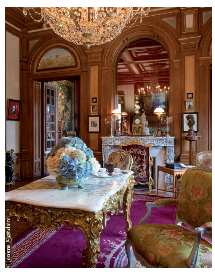
The Maison Mantin has been restored as a pristine example of 19th-century style after remaining untouched for over 100 years.

Left untouched for over a century, the enormous Mantin mansion in Moulins, located in the Auvergne region of central France, is a time capsule of 19th century life. After 105 years of total abandonment, the Maison Mantin has been renovated and opened to the public as a museum in keeping with the owner's last wishes.