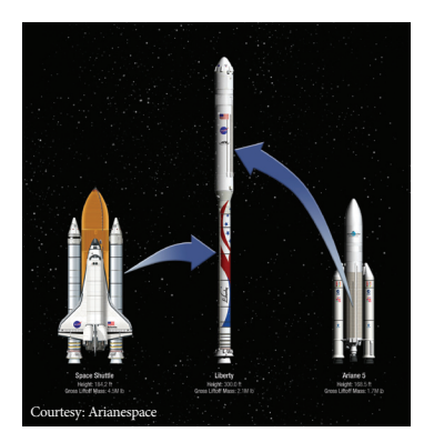
The Liberty launch vehicle combines the proven systems from the NASA Space Shuttle and French Ariane 5 launch system.

the Ariane 5 rocket, developed by Astrium and operated by Arianespace, the European space consortium headquartered