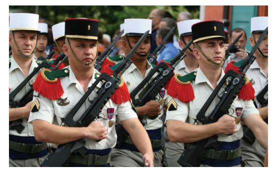
French legionnaires represent France at a parade in 2009. The Képi blanc is a hallmark of the légionnaires.

The Legion has most recently been dispatched to Chad (1969-70), Zaire (1978), the Gulf War (1990-1991), Kampuchea, Somalia