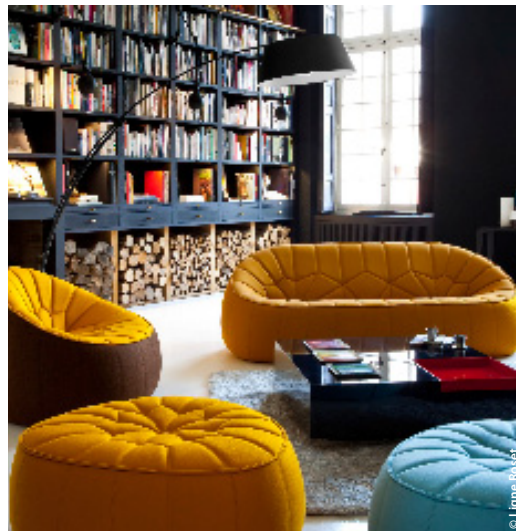
This living room has been furnished with Ligne Roset classic designs, including the Pumpkin sofa, a company staple.