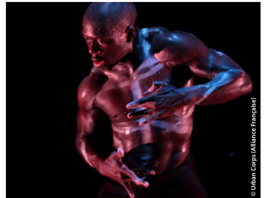
The Compagnie Stylistik performed the piece "Entre Deux" at Howard University's Ira Aldridge Theater.

▲ From May 17 through May 25, the Alliance Française of Washington, D.C., presented Urban Corps: A Transatlantic Hip-Hop Festival celebrating the shared cultural relationship between France and the United States in the world of contemporary urban dance. Several notable venues in the capital hosted the festival's five performances throughout the week, including Howard University, Kalorama Park and the Kennedy Center.