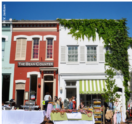
Georgetown's Wisconsin Avenue was transformed into a classic French marketplace on April 29 and 30.

Making their way among shoppers, vendors and even a mime, attendees enjoyed sidewalk delicacies, such as croissants, crêpes and colorful French macarons . Early attendees were given free baguettes. In a neighborhood known for its shopping, visitors discovered a myriad of marked-down goods from nearly 40 Georgetown boutiques.