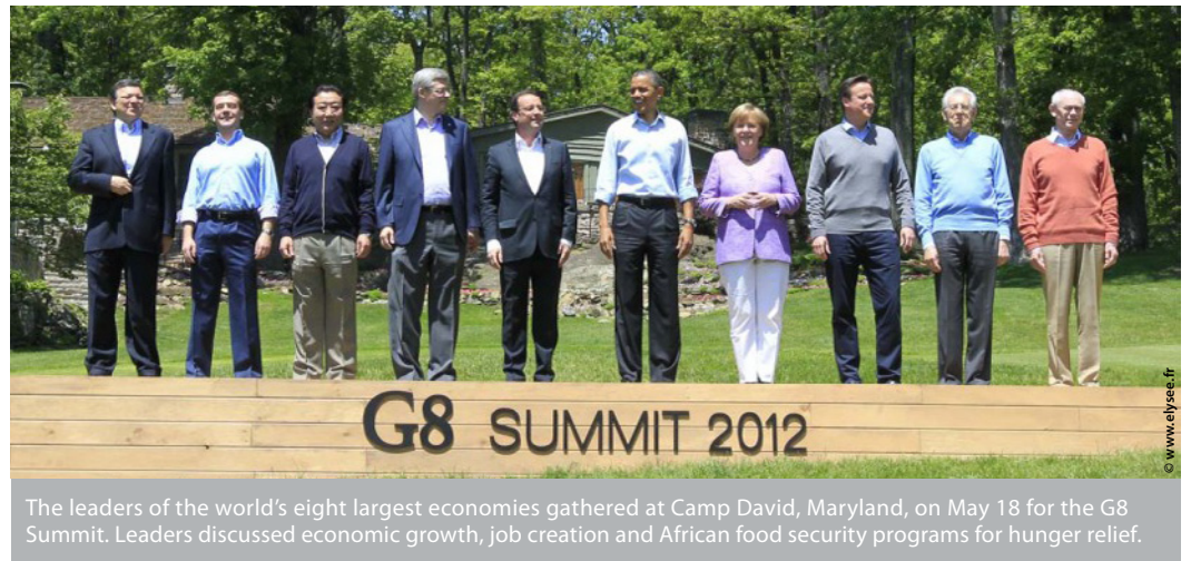
The leaders of the world's eight largest economies gathered at Camp David, Maryland, on May 18 for the G8 Summit. Leaders discussed economic growth, job creation and African food security programs for hunger relief.

After the Camp David meeting, most of the G8 leaders then headed to Chicago for the NATO Summit. Following their first encounters, Mr. Obama told a top advisor, "It's clear that France is going to be a good friend and ally."