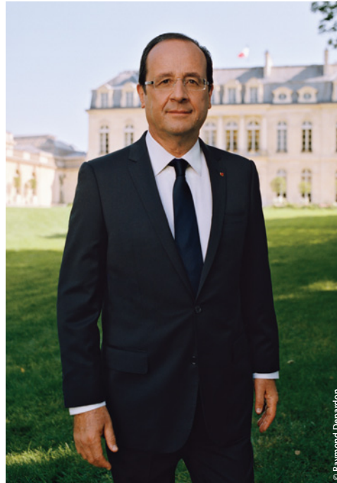
Mr. Hollande's lifelong involvement in politics brought him to France's Presidency on May 15.

It was during his time at the ENA that Mr. Hollande took his first steps in the political arena. He was frequently elected into the National Union of Students in France. Later, he began making political headway, serving as municipal counselor for the commune of Ussel in the Corrèze region of central France beginning in 1983. He climbed up the political ladder, working at the Élysée, the Presidential headquarters, as an assistant to the special advisor Jacques Attali and serving at the Cour des Comptes, France's national auditing agency, from 1984 through 1988. Mr. Hollande eventually won a seat in the National Assembly, France's lower parliamentary body, and became First Secretary of his party in 1997.