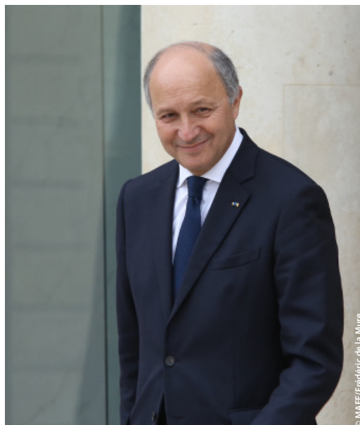
Laurent Fabius brings more than three decades of political experience to the new cabinet, established in May.

Mr. Fabius will direct France's global affairs through challenges including the euro currency turmoil, France's diplomacy with the "Arab Spring" countries in the Middle East, and plans for Afghanistan.