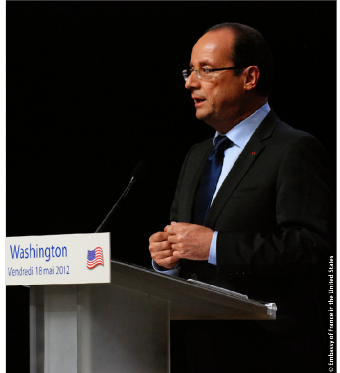
President François Hollande addresses a crowd during a May 18-21 visit to the U.S. He met with heads of state at the G8 and NATO Summits.

For more information and photos on President Hollande's official visit to the United States, please visit www.ambafrance-us.org . Also see photos of the events on the embassy's Facebook page (address on p. 8).