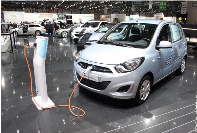
Spectators at the Electric Vehicles Symposium in Los Angeles were able to test drive brand-new electric cars, many of which featured French parts and components.

▲ The French government's export promotion agency, Ubifrance, showed off its progress this May with a product that it hopes will be economically lucrative: electric cars. Acting as the host of a number of French companies working in hybrid and electric car production, Ubifrance oversaw the French delegation to the 26th Electrical Vehicle Symposium (EVS 26) in the Los Angeles Convention Center from May 6 through 9. The delegation, under the heading of EV France, was a consortium of 22 diverse companies, from established car companies Renault and PSA Peugeot-Citroën, to research and development