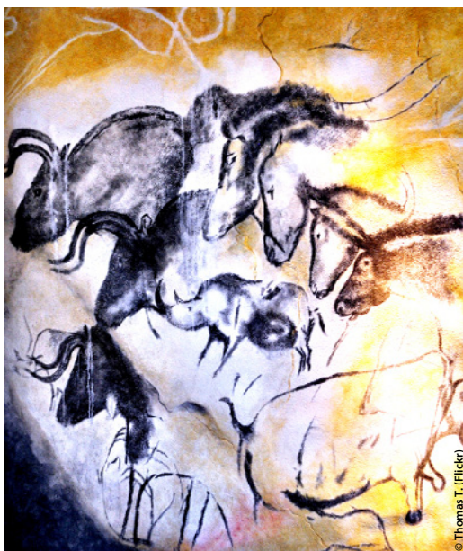
Recently unearthed, this painting of horses, done in red and blue, might be part of the world's oldest cave mural.

Many rock shelters in southern France have yet to be explored, and the team intends to continue its excavations throughout the coming months.