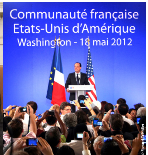
Left: French President Hollande met U.S. President Barack Obama at the White House's Oval Office on May 18. Right: President Hollande addressed Washington's French community at the embassy the same day. His remarks detailed his political and economic projects, as well as the importance of promoting French culture and language globally.