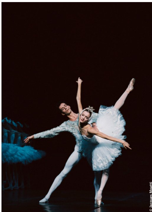
In a series of shows from June 26 through July 1, the Paris Opéra Ballet will showcase four works in Chicago.

The evening will include French legend Maurice Béjart's fiery choreography of Le Boléro , coupled with the Grand Park Orchestra playing French composer Joseph-Maurice Ravel's famous Spanish theme. The company will also perform Serge Lifar's one-act ballet Suite en Blanc and Roland Petit's L'Arlésienne , a tragic saga based on the short story by 19th-century French novelist Alphonse Daudet.