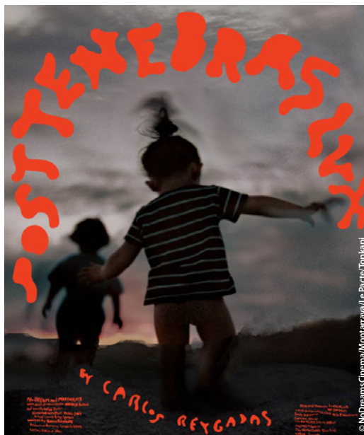
"Post Tenebras Lux," a Mexican film at the 2012 Cannes film festival, benefited from the "Aide aux Cinémas" fund.

Puerto Rico is famed for its tropical climate and lively Latin American culture—yet many people may not know that the island has been home to a sizeable Corsican population for 200 years. Best known as the birthplace of Napoleon Bonaparte, Corsica is a department of France situated in the Mediterranean Sea below France's southern coast. As France exerted more control over the island during Bonaparte's reign, many Corsican partisans went into exile. An 1815 Spanish decree encouraged non-Hispanic Catholics to immigrate to its Caribbean colonies, with the hopes of maintaining the country's colonial power. The legislation spurred an influx of Corsicans to Puerto Rico, then under Spanish control. Even after the decree's repeal in 1836, many Corsicans continued immigrating. Today, the population has grown from a small enclave on the Southern coast to a vibrant modern community.