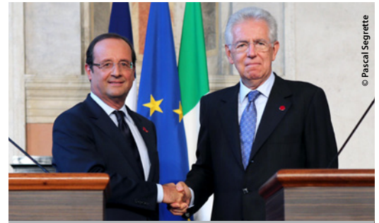
President Hollande visited Italian prime minister Mario Monti on September 4 to discuss eurozone solutions.

Minister Fabius discussed major European issues with German Minister of Foreign Affairs Guido Westerwelle in Bonn, Germany on September 5. The meeting took place in the context of the "Franco-German Year," celebrating the 50th anniversary of the signing of the Elysée Treaty, one of