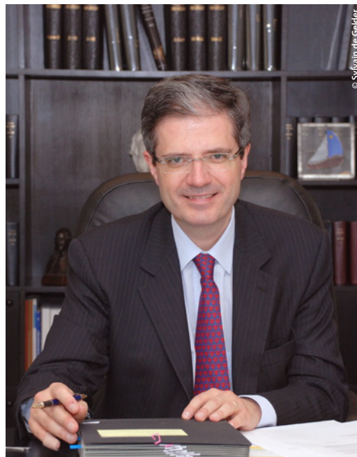
“From the Ambassador’s Desk” will be appearing each month. Your comments are welcome (see p. 8).