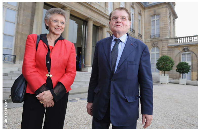
Since Nobel laureates Françoise Barré-Sinoussi and Luc Montagnier first identified the HIV/AIDS virus in the 1980s, France has acted among the disease's leading global experts.

While treatments and vaccines aimed at completely eradicating the virus still remain to be developed, the international community is advancing in the global fight against HIV/AIDS, one which French scientific efforts are helping with their important discoveries and promising results.