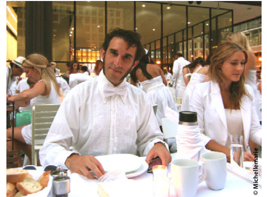
A diner embraces the quirky spirit of the "Dîner en Blanc," a sensation that swept six U.S. cities this summer.

An annual event in Paris for over twenty years, Dîner en Blanc is rapidly spreading across the U.S., providing Americans in places like Atlantic City, Cincinnati, Las Vegas and New Mexico a chance to enjoy an evening of conviviality à la française .