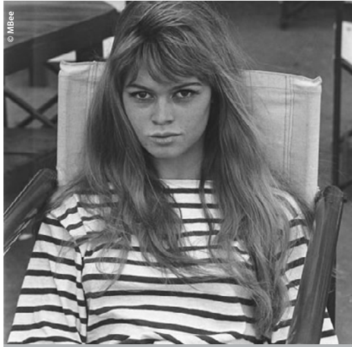
A teenage Brigitte Bardot sports the Breton stripes for which the brand Armor-Lux, now in New York, is famous.

▲ As the first Armor-Lux store in America approaches its first birthday, the New York City location, known for its iconic French mariner tees, is thriving.