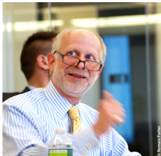
A mentor gives a thumbs-up to one of the many pitches delivered during the 2012 startup incubator in Boston.

With growing popularity and participation, the promising program is expected to continue enhancing the future of French-American cooperation for startup technology companies.