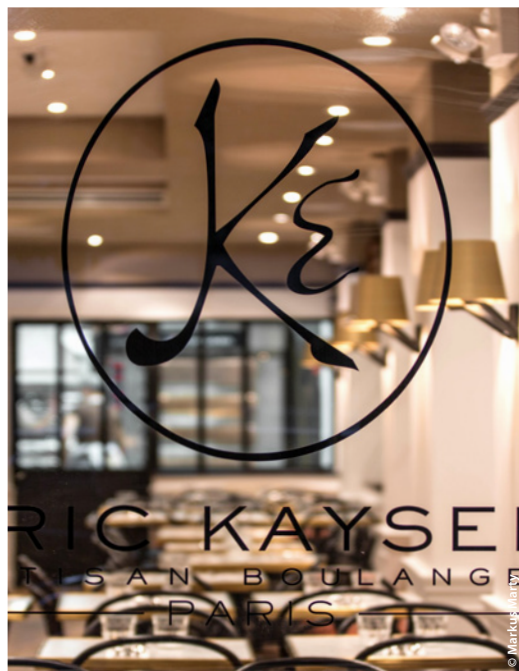
With nearly 80 stores around the world, the Maison Kayser has set up in Manhattan to immediate success.

from the Ladurée pastry shop, a Paris favorite, which opened its New York location last year.