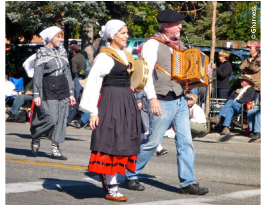
Descendants of Basque farmers, who immigrated to the western U.S. in the early 20th century, parade in Idaho.

Even as some traditions fade, others, like celebrating the religious feast day of Saint Ignatius of Loyola and the annual Boise “Shepherd's Ball,” continue to delight