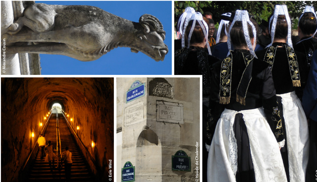
Clockwise from top left: A gargoyle grimaces at crowds below; Breton maidens don traditional dress; a patchwork of street signs shows a corner of Parisian history; a tunnel leads up from the Pommery champagne caves in Reims.

▲ “Hidden Heritage” was the theme for this year’s “European Heritage Days,” observed in France on September 15 and 16. The annual two-day event was an opportunity to explore French cultural heritage, notably through visits to some of the nation’s most valued sites.