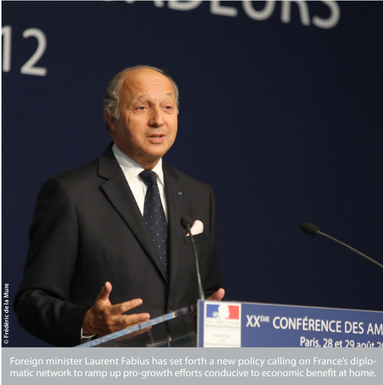
Foreign minister Laurent Fabius has set forth a new policy calling on France's diplomatic network to ramp up pro-growth efforts conducive to economic benefit at home.

Following a busy summer that included national elections, chairmanship of the U.N. Security Council and continued support of the Syrian people, France has now named a new top priority: “economic diplomacy.”