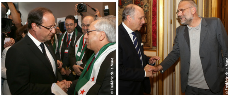
Minister Fabius speaks next to Hillary Clinton on September 30; Mr. Fabius welcomes a leader of Syria's religious minorities; Mr. Hollande listens to Syrian opposition leadership.