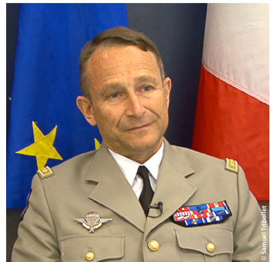
Gen. Pierre de Villiers, France's Chief of Defense Staff, met with Gen. Martin Dempsey and U.S. strategic commands.

The delegation then traveled to Tampa, where on April 25 Gen. de Villiers visited U.S. Central Command (CENTCOM) as well as U.S. Special Operations Command (SOCOM) for further briefings on security activities of mutual interest to France and the United States.