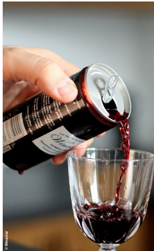
The French company Winestar has partnered with a U.S. packaging firm to create an eco-friendly can containers.

New trends in market needs make these wines more appealing. The convenience of a single-serve can of wine allows for consumption control and variety while avoiding waste. With Winestar's goals to expand, the enhanced selection will allow for consumers to create their own collection at home.