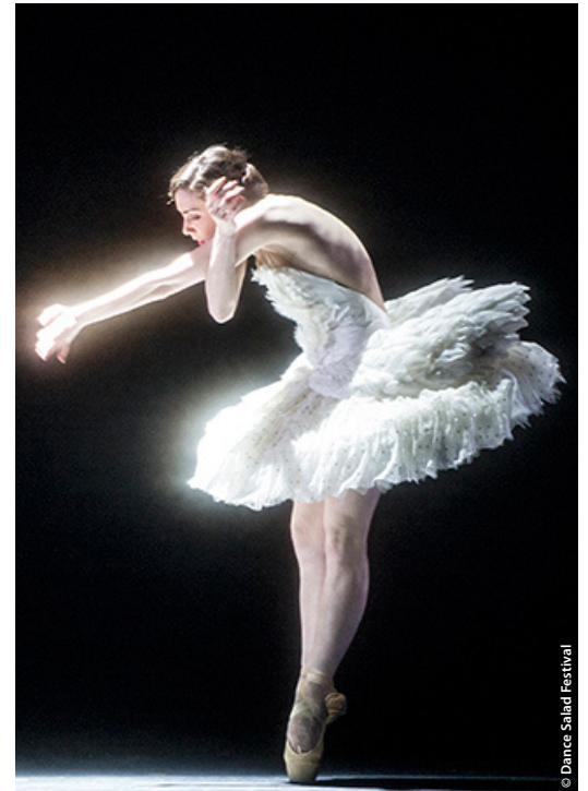
The Dance Salad Festival returned to Houston for its 19th year of French and international dance performances.

Artist to Artist Workshops is a series that allows the local Houston dance community to learn choreography from some of the world's leading dancers. Workshops are at all levels of dance and occurred April 15 through 18. The Open Workshop open to intermediate and advanced dance students at a nominal fee.