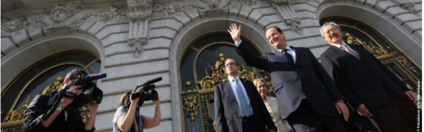
Top left: Virginia Gov. Terry McAuliffe and Amb. François Delattre sign a sustainability agreement in March. Top right: the Rencontres Quai d'Orsay-Entreprises event on April 9. Center: the facts and figures of France's economic diplomacy plan. Bottom: President Hollande promotes economic diplomacy in San Francisco in February.