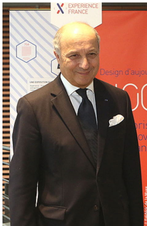
Foreign Minister Fabius spoke at the Rencontres Quai d'Orsay-Entreprises meetings held on April 9 in Paris.

- Laurent Fabius, Minister of Foreign Affairs