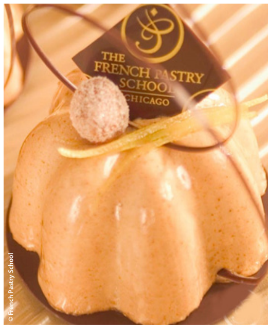
Founded in 1995, the French Pastry School, based in Chicago, has trained a generation of U.S. food professionals.

▲ On April 3, the Embassy of France hosted a night all about pastries as part of the Francophonie Cultural Festival.