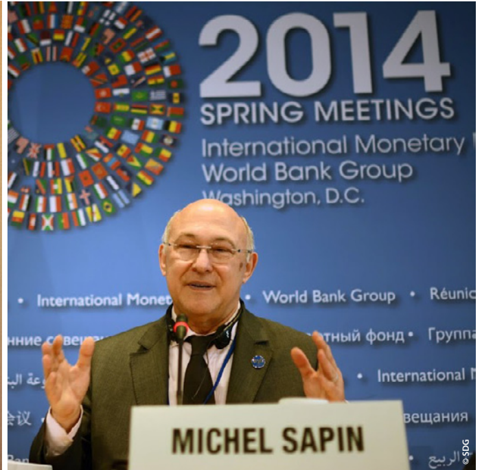
Appointed on April 2, French Finance Minister Michel Sapin traveled to Washington for the annual Spring Meetings at the International Monetary Fund (IMF) and the World Bank on April 10 through 12. Among many other officials, he met with U.S. Secretary of the Treasury, Jacob Lew (left). Please see full story on p. 3