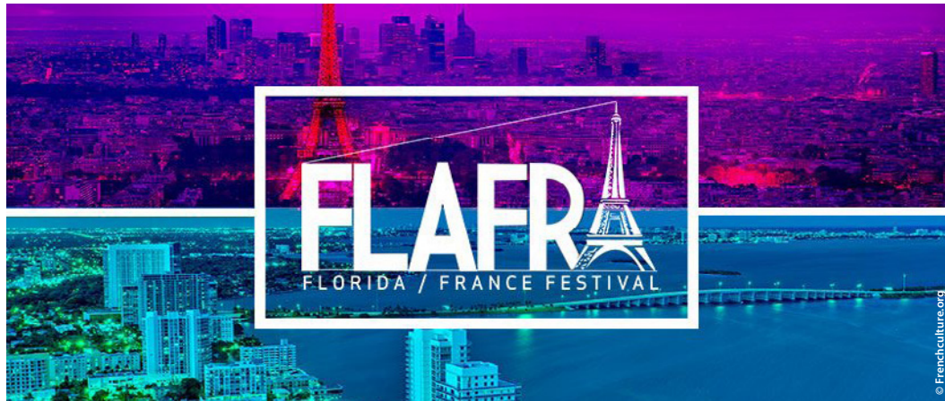
In a vibrant example of French and regional partnership, the FLA-FRA Festival offered music, movies, and art to Miami residents and visitors throughout the month of April. Highlights included DJs and a François Truffaut film retrospective.

▲ Throughout the month of April, the FLA-FRA Festival took place in Miami. The event, a project organized over a period of two years, was created to bring together French and Floridian artists in a new and innovative way.