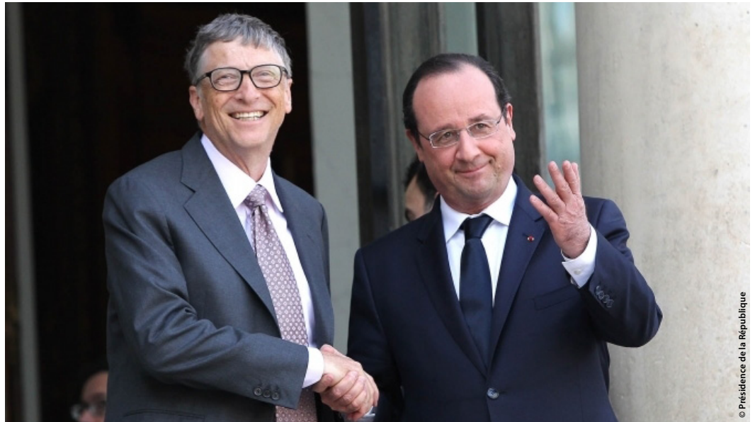
During a meeting at the Elysée Palace in Paris on April 1, Messrs. Gates and Hollande explored opportunities in greater partnership between France and the philanthropic Bill and Melinda Gates Foundation, which Mr. Gates co-chairs.

▲ On April 1, French President François Hollande welcomed Bill Gates, co-chair of the Bill and Melinda Gates Foundation, to the Elysée Palace in Paris. The meeting served primarily as an opportunity for in-depth discussion about the challenges faced in development and international solidarity, with a particular focus on Africa. The meeting occurred just before the EU-Africa summit in Brussels which took place on April 2.