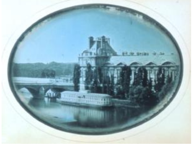
Louis-Jacques-Mandé Daguerre The Pavillon de Flore and the Pont-Royal, 1839 (Courtesy: Metropolitan Museum of Art)

receiving 6,000 francs a year for it in return. The daguerreotype was an instant success, spawning a daguerreotype mania that spread throughout France, Europe, and the United States, where it was especially popular.