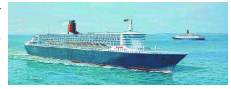
An artist's rendition of the Queen Mary 2

cruises on the weekend of September 26, in anticipation of its maiden transatlantic voyage in January. The test cruise, conducted by 450 engineers and technicians, set off from the port of Saint-Nazaire, and ran