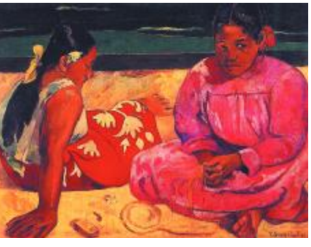
Femmes de Tahiti, aka Sur la Plage

HE NATIONAL GALLERY of the Grand Palais in Paris is holding an exhibition on French painter Paul Gauguin (1848-1903). "Gauguin-Tahiti, the Atelier of the Tropics," commemorates the centennial of his death. The flamboyant exhibit, which will run until January 19, 2004, focuses on two periods that Gauguin spent in the South Pacific: in Tahiti from 1891 to 1893, and then on the Marquis Islands from 1895 to 1903. It was during these years overseas that his painting