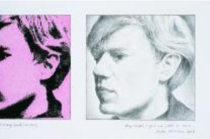
Dyptique Andy Warhol, 2003, by André Raffray

participants included famous galleries such as Marian Goodman (of New York), Gimpel Gallery (of London) and Tega (of Milan) once again