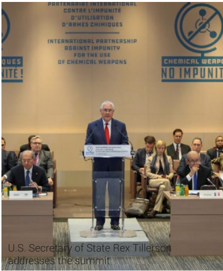
U.S. Secretary of State Rex Tillerson addresses the summit

ON JANUARY 23, 2018 the International Partnership against Impunity for the Use of Chemical Weapons was launched in Paris. The main goals of the partnership include maintaining an updated list of those who use chemical weapons, sharing this information with other States and organizations, as well as making the information easily available online.