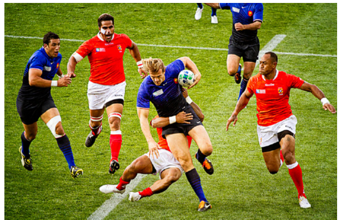
Opposite page: Paris during the Olympic days, celebrating sports as part of the Paris2024 bid; This page top: The Paris Gay games logo, Ambassador Araud at an event promoting the Paris 2018 Gay Games; row 2: President Mitterrand, an avid golfer, playing at le golf national; the Ryder cup trophy Row 3: France 2023 Rugby fans, the French team playing Tonga in the 2011 Rugby World Cup below: The French Women's Under -20 team plays Ghana in a qualifying match, the France 2019 FIFA Women's World Cup bid logo.