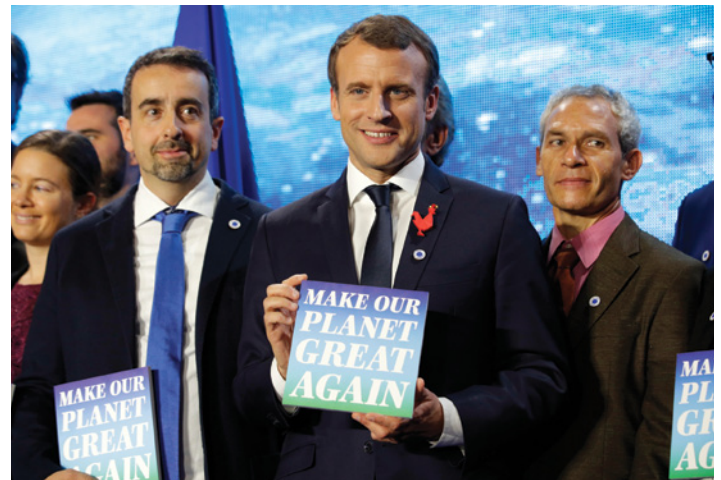
| President Emmanuel Macron addresses the One Planet Summit.