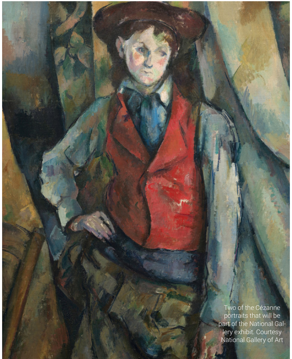
Two of the Cézanne portraits that will be part of the National Gallery exhibit.