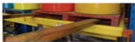
Easy forklift access to stored pallets