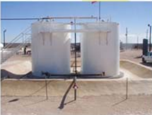
Create remote area earthen bunds