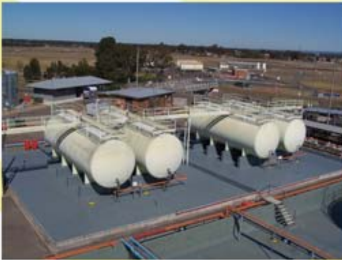
Large-scale chemical storage areas